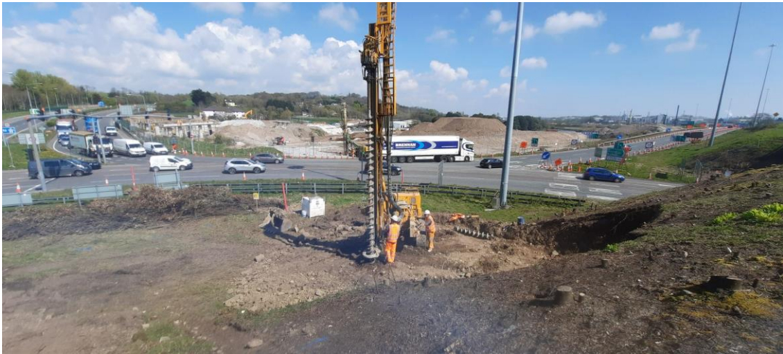
Investigatory probing works ahead of piling at the Dunkettle Interchange Roundabout.

week and will continue over the coming weeks as necessary – see photograph below.