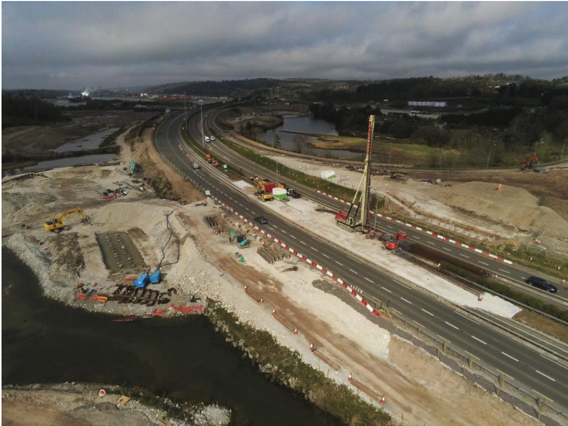
Installation of piles in the N25 central median for ST01.