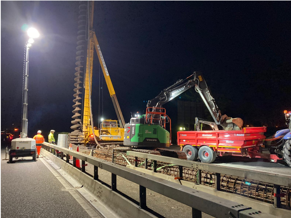
Bored Piles being installed in the central median of the N25 under a night time closure.