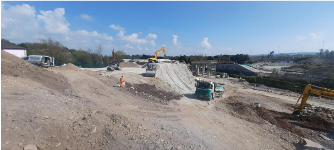
ST09 abutments and central pier nearing completion to receive bridge beams.