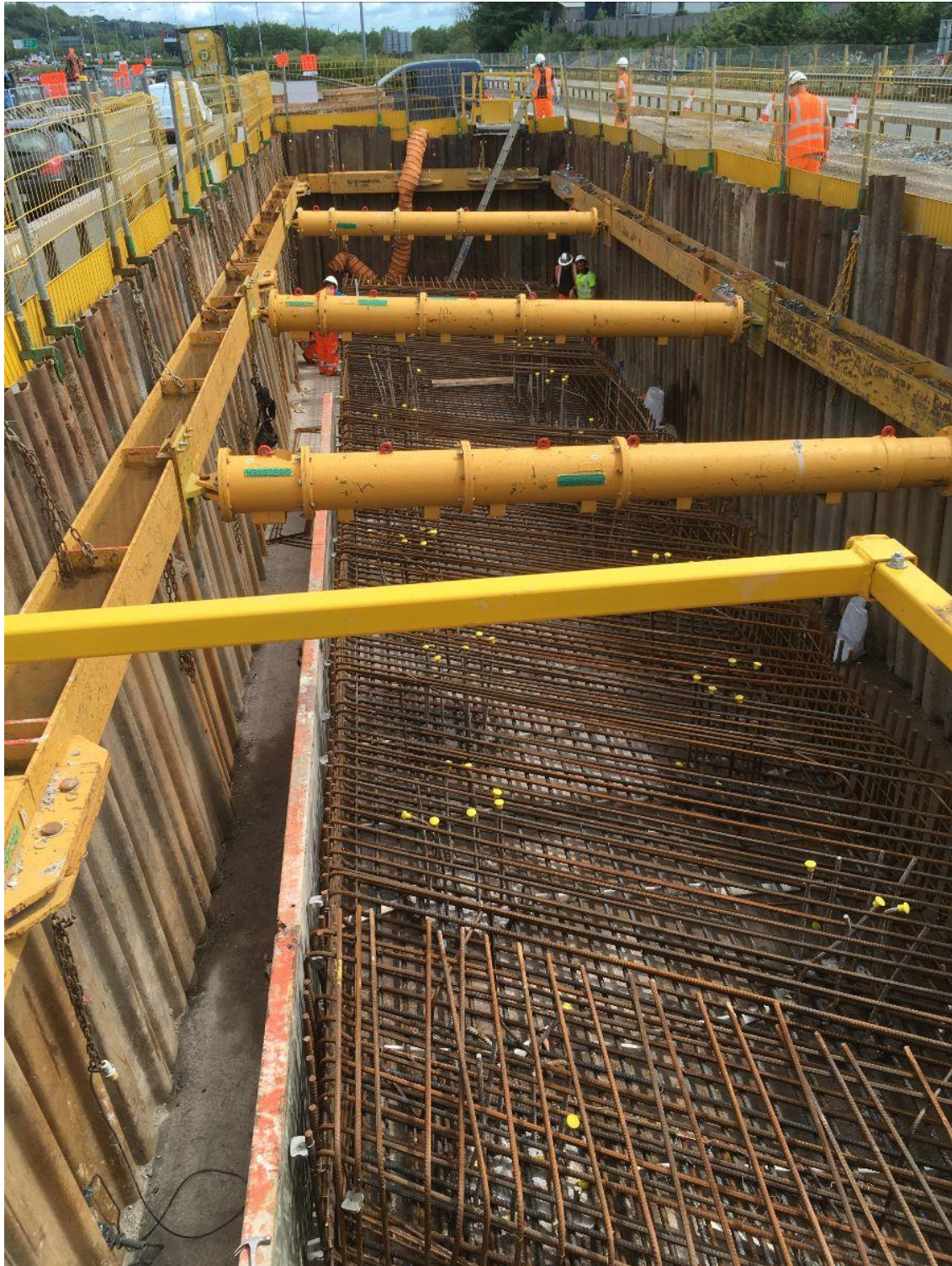
Steel fixing works nearing completion for the north centre pier pile cap at ST01.