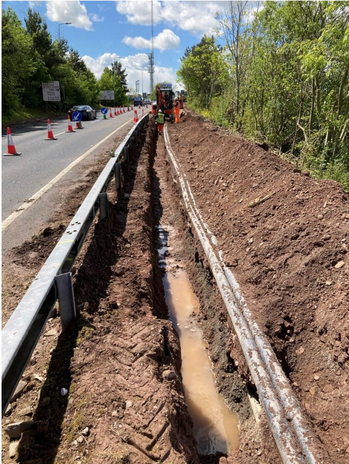
Ducting being installed on the approach to Mahon Point.