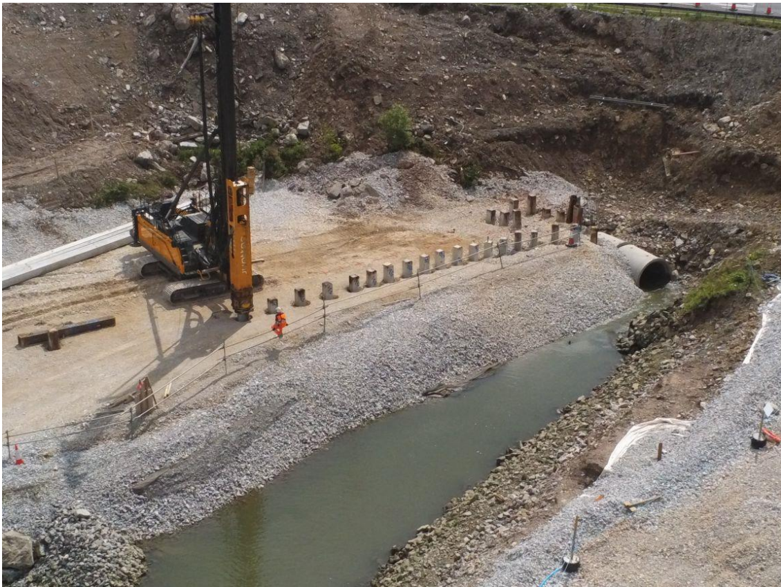
Pre-cast concrete piles being installed at Culvert 02 beside the intertidal area.