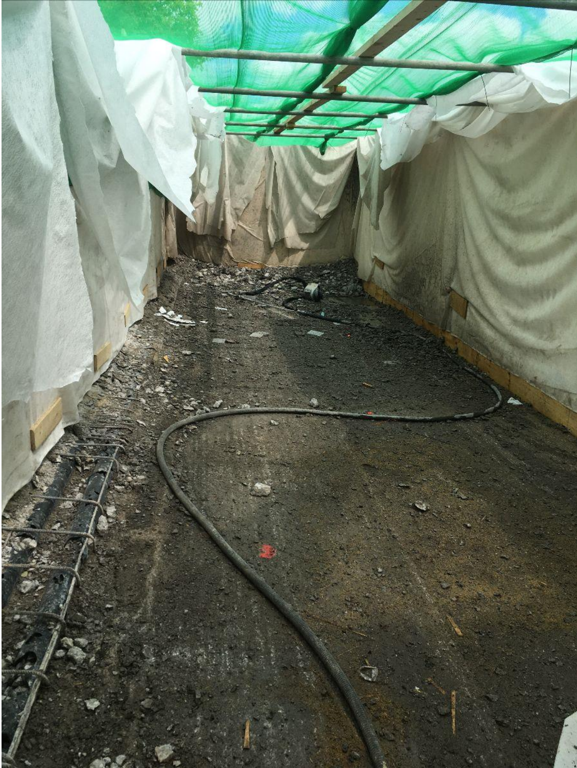
ST10 demolition works enclosed adjoining the live M8 northbound