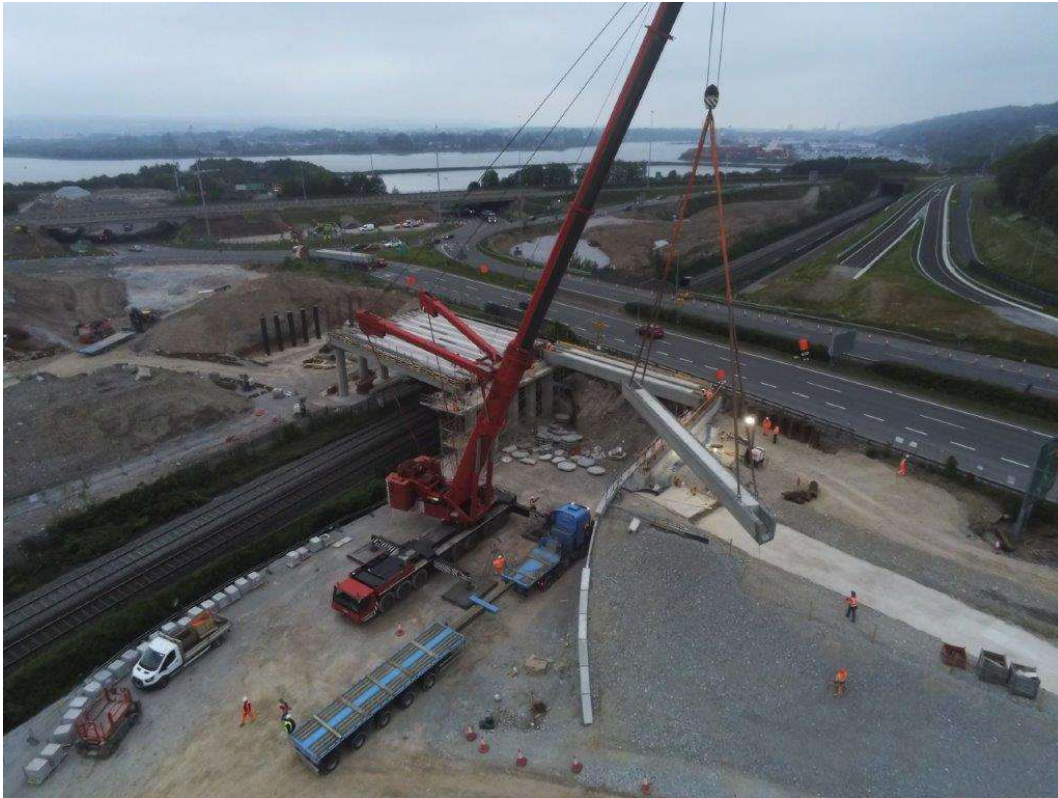
Installation of pre-cast concrete beams to ST08.