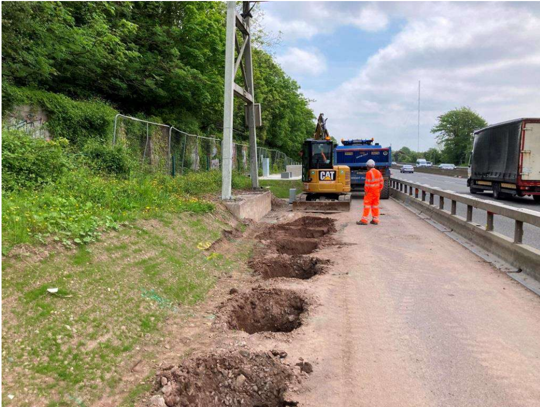
Excavation works being completed for safety barrier post installation on the N40 eastbound.