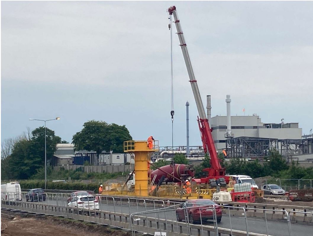
Concrete works being progressed for the ST01 columns.