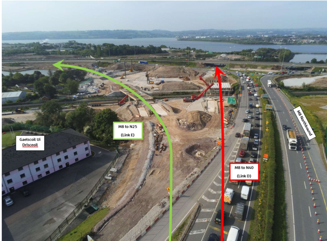
Aerial view of the footprint of the proposed Link D & E roads.