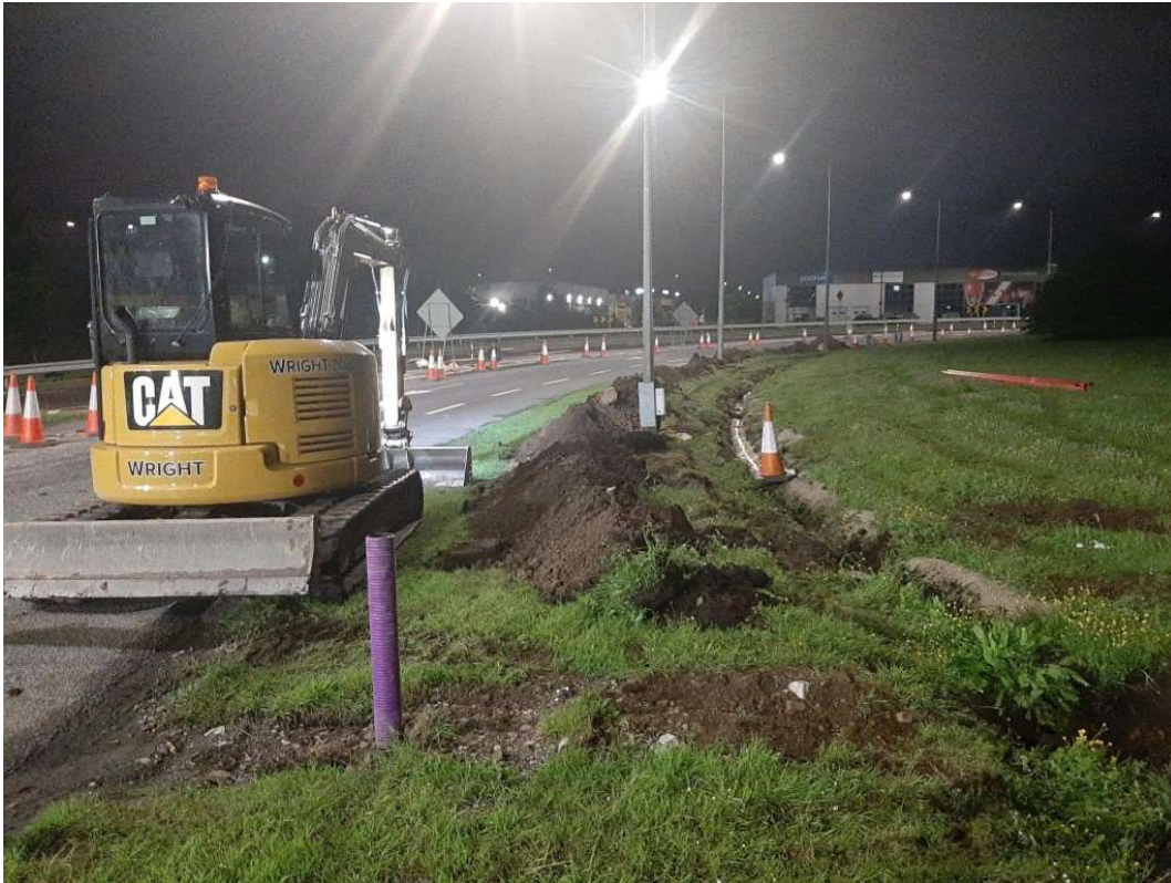
Installation of ducting by night on the Little Island slip road merge with the N25 westbound.