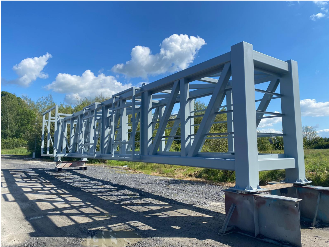
Structural steel elements ready for erection for a portal gantry.