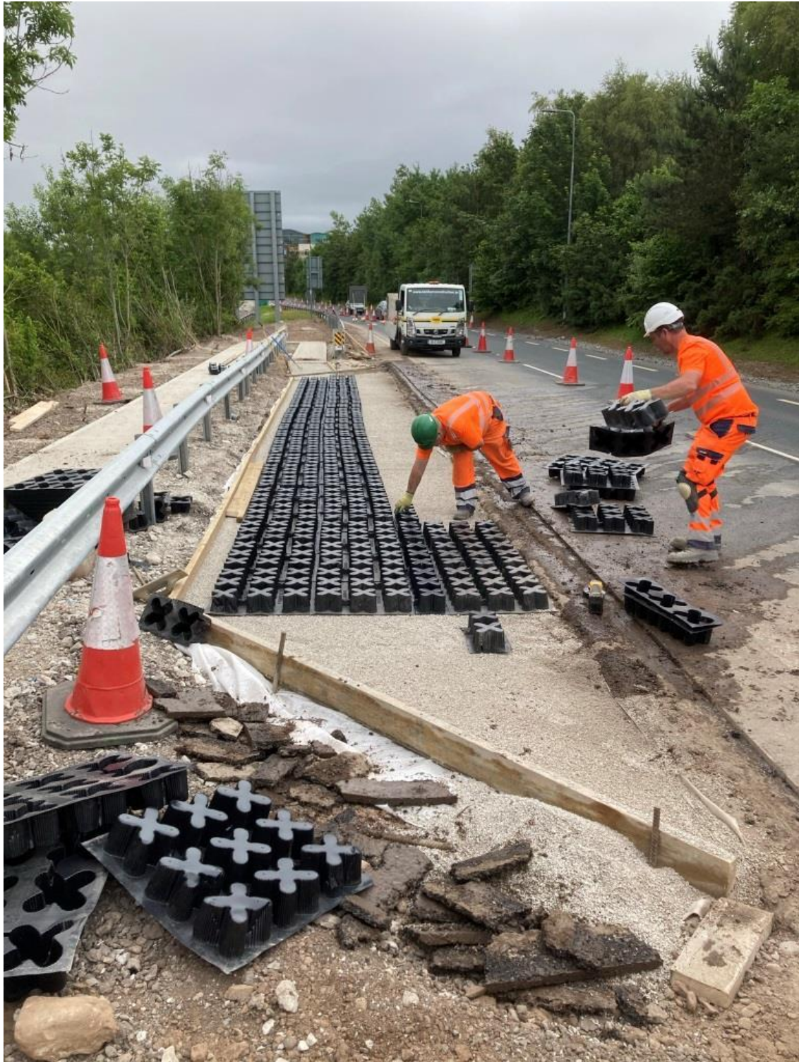
ITS maintenance layby construction ongoing near Jacobs Island.