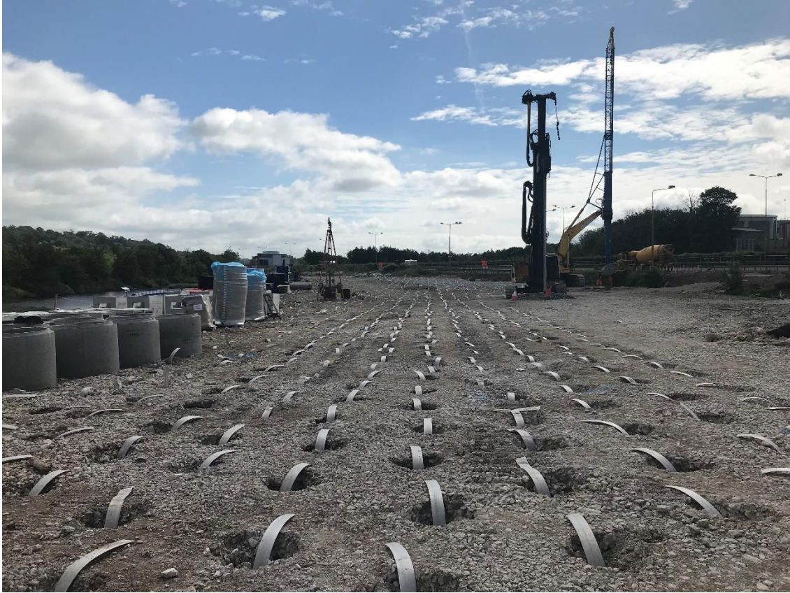
Installation of vertical drains under the Link I road embankment North of the N25.