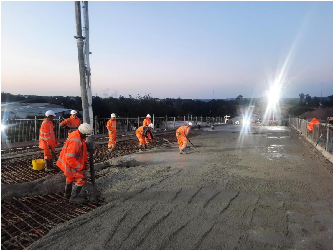
Concrete being pumped onto the bridge deck of ST09 as dawn breaks – Friday 18th June, 2021.