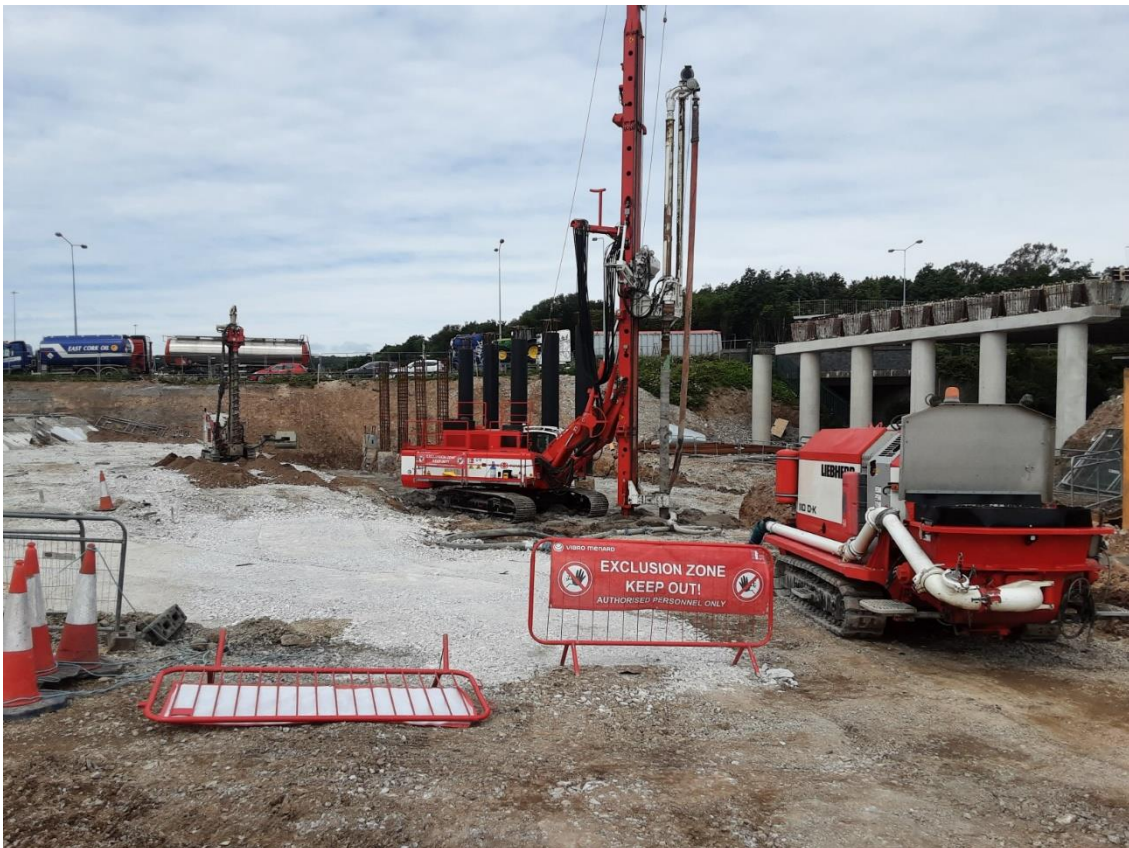
CMC piling works ongoing at Link D south of ST08.