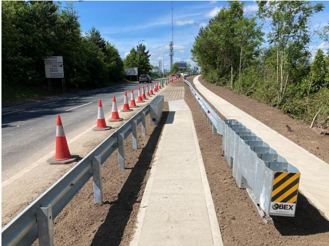
ITS maintenance layby construction complete near Jacobs Island.