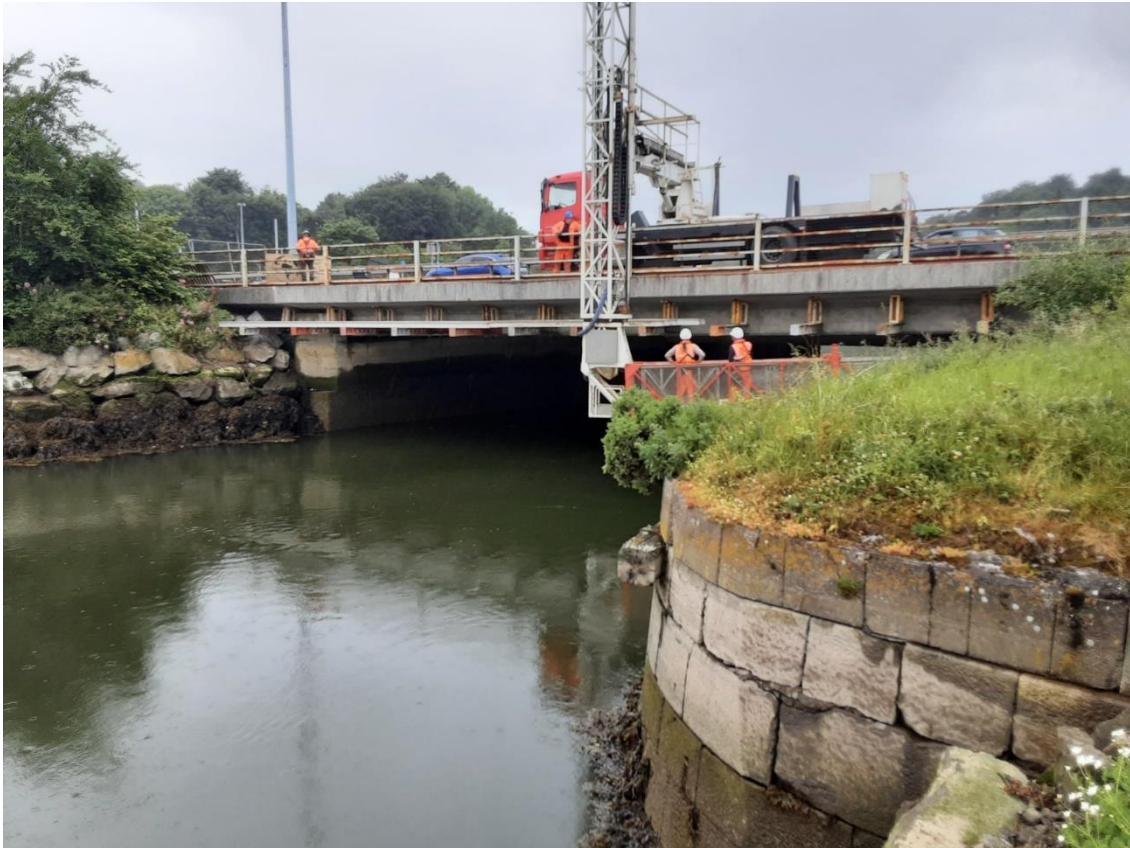
Ongoing preparatory works for the installation of the working platform at ST14.