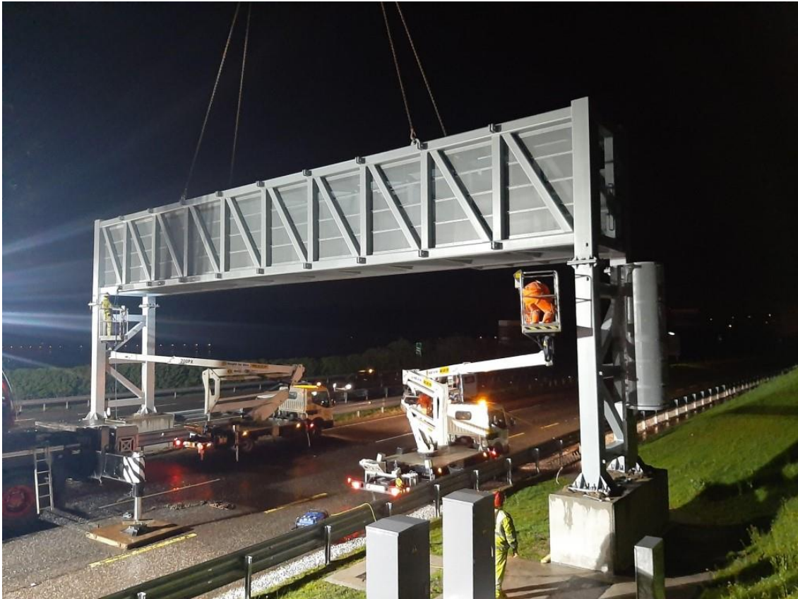
Structural steel erection on the N40 eastbound.