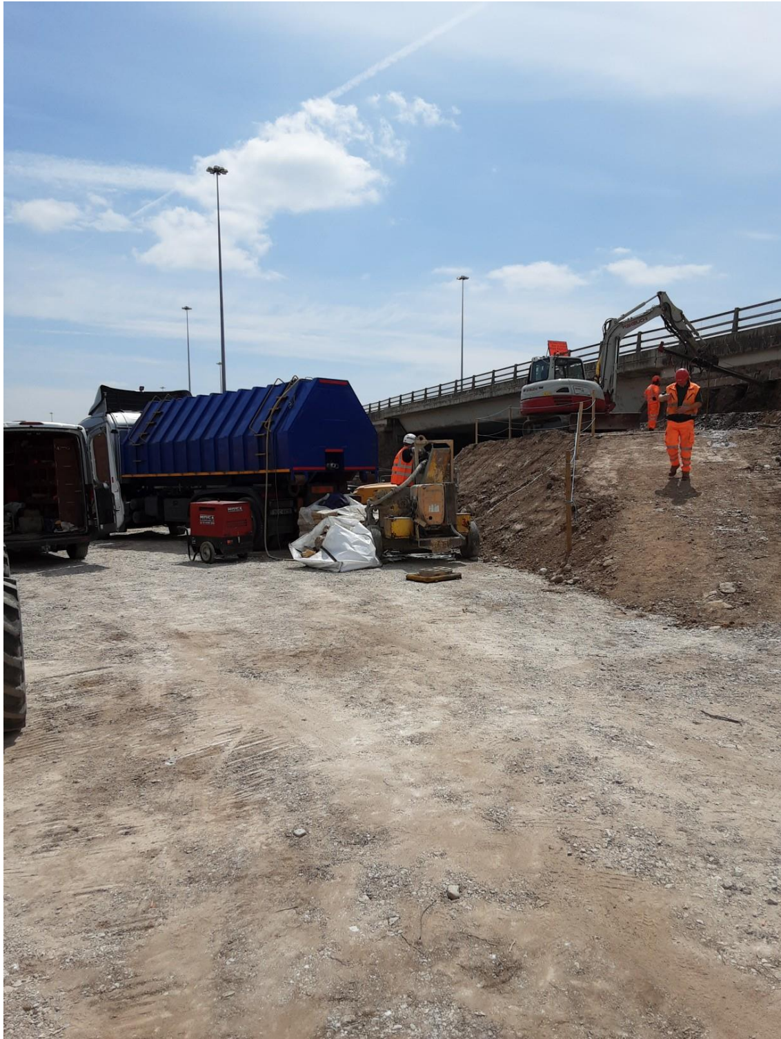
Soil nail installation works ongoing at the northern side of the Dunkettle Interchange Roundabout.