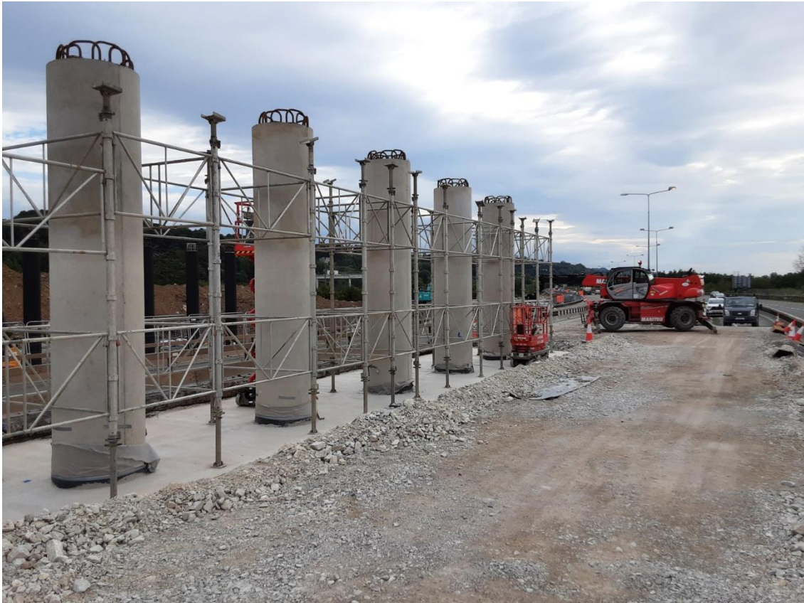
ST01 being progressed in the N25 central median.