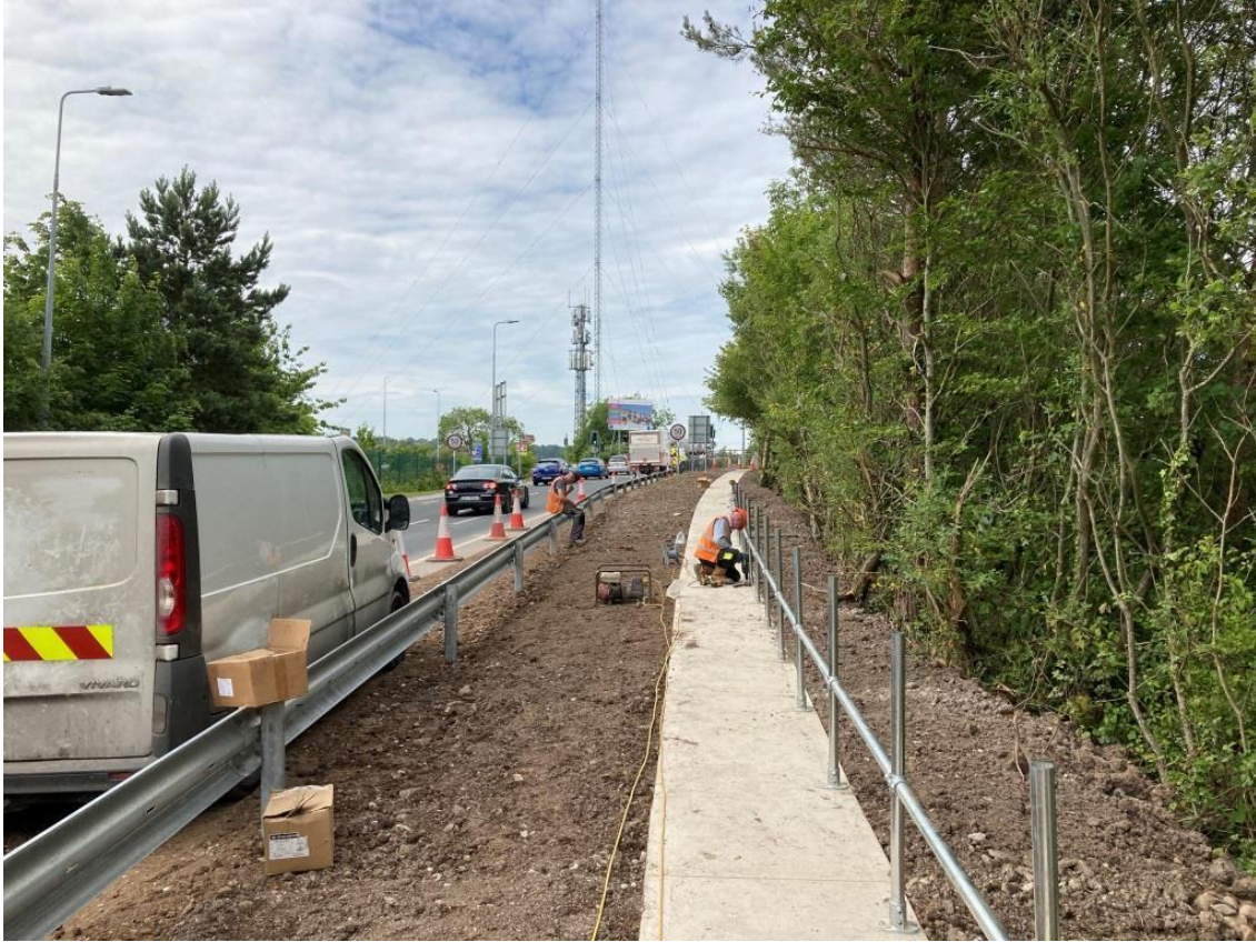
Finishing works being completed at the ITS sites in the vicinity of the Mahon Point Interchange.