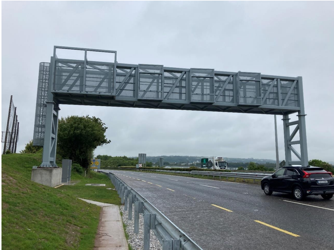
Recently installed structural steel portal gantry on the N40 eastbound.