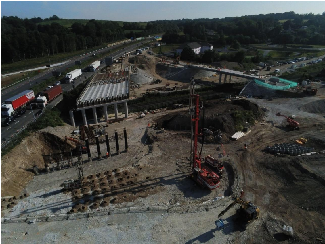
CMC piling works being progressed south of ST08.