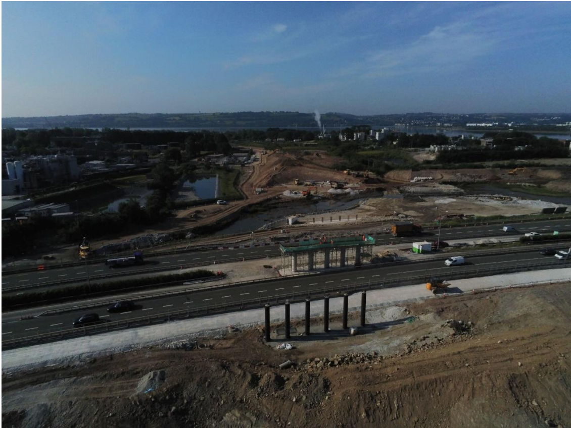
ST01 steel fixing being progressed in the N25 central median