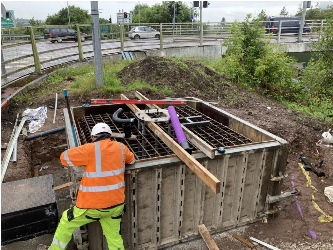
Preparation of the last foundation for a CCTV camera alongside the Mahon Point Interchange.