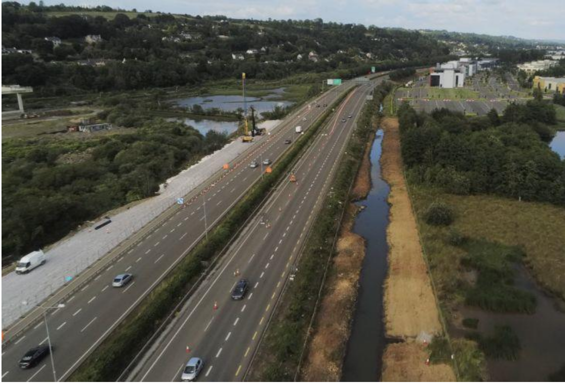
Vertical Drainage Installation for Link I alongside the N25 eastbound.