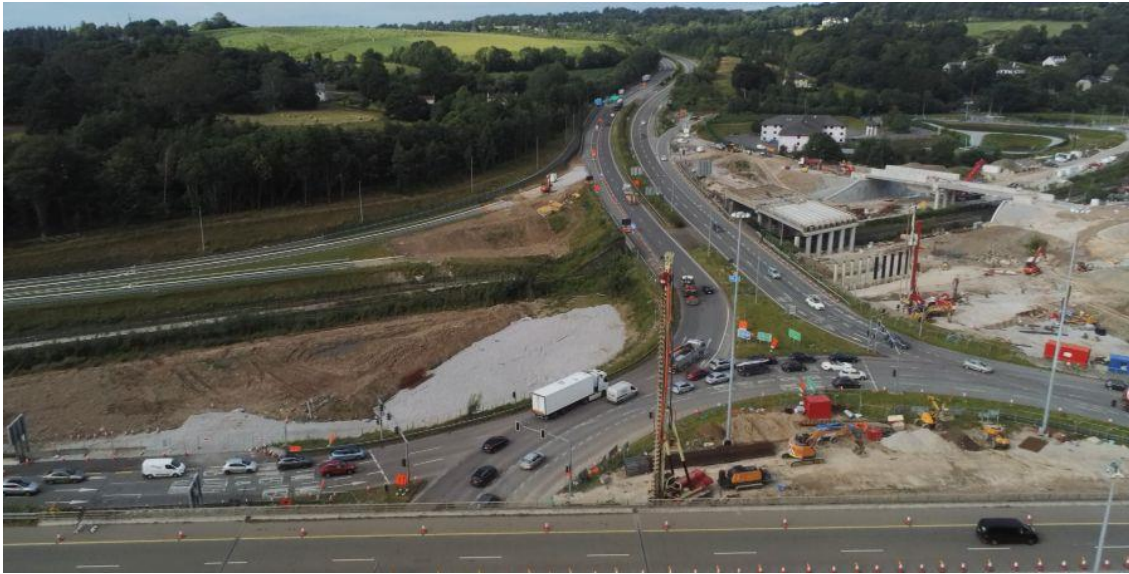
Piling works ongoing at ST06 at the Dunkettle Interchange Roundabout.