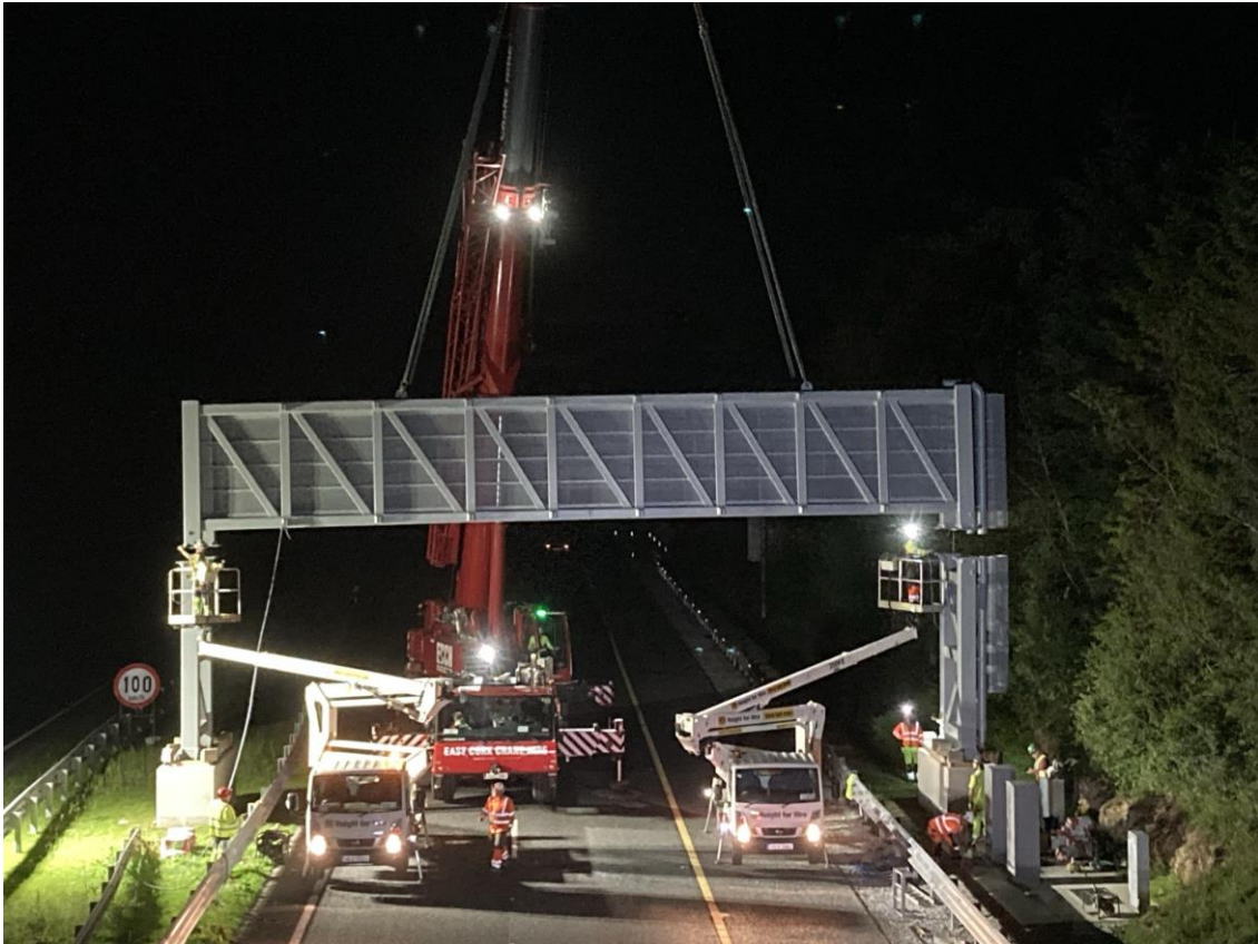
Installation of the portal structural steel on the M8 southbound.