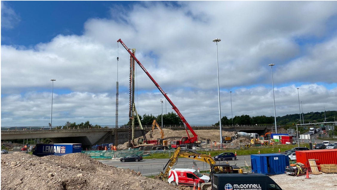
Piling works ongoing at ST07 with the reinforcement steel cage being lifted into place by a crane.