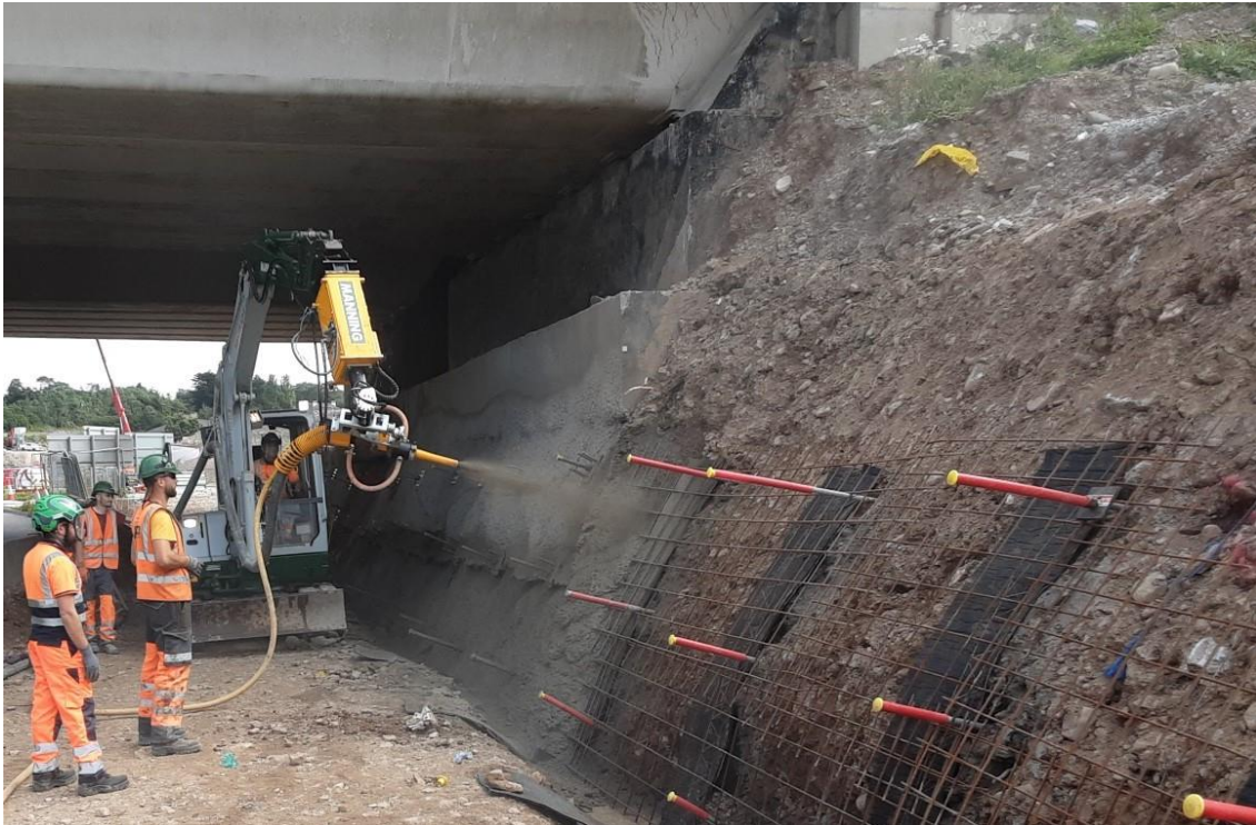
Concrete shotcrete being completed at RW05.