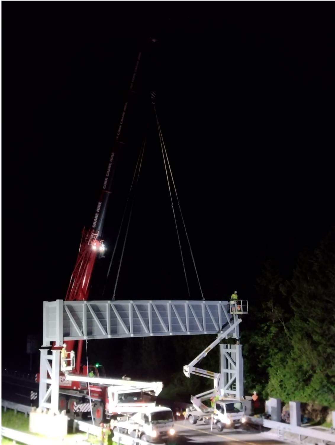
Structural steel portal gantry installation being completed on the M8 southbound under a night time road closure.