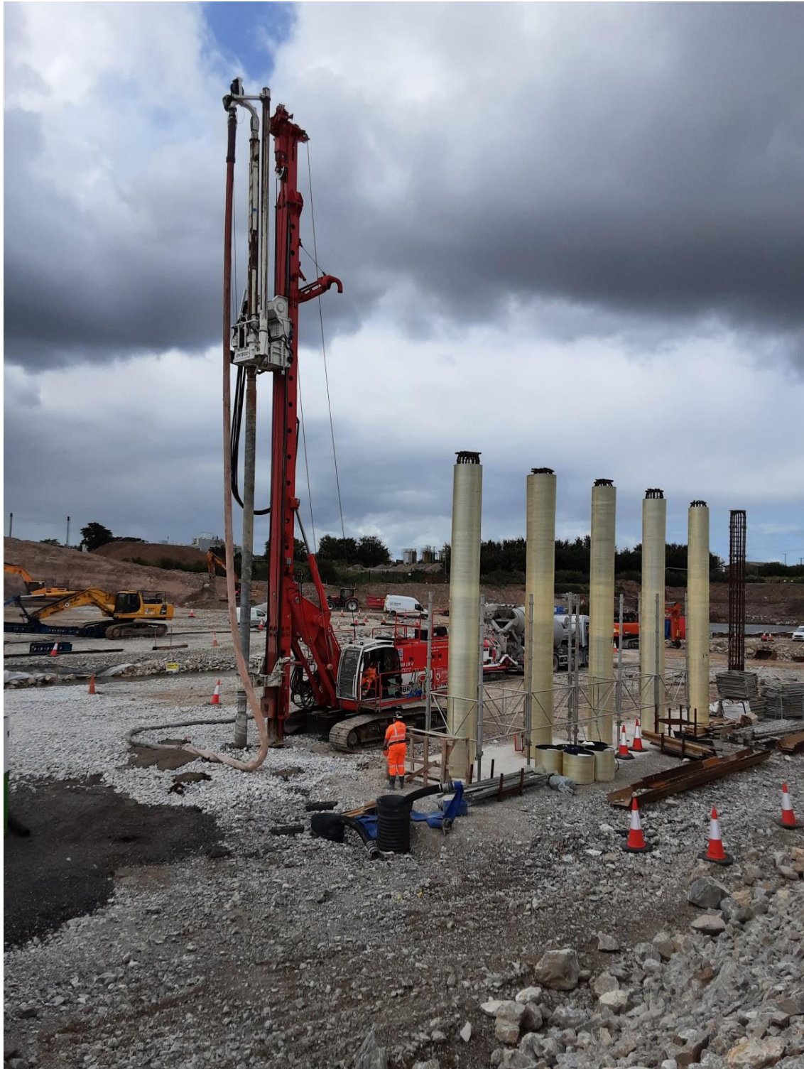
CMC ground improvement works ongoing south of the N25 under the proposed Southern Dumbbell Roundabout.