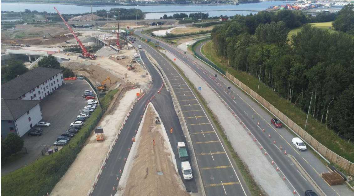
Temporary Alignment at re-opened 'Ibis Slip Road', merging with M8 Southbound

caution through this section of the site while people adapt to the new layout – see photograph hereunder.