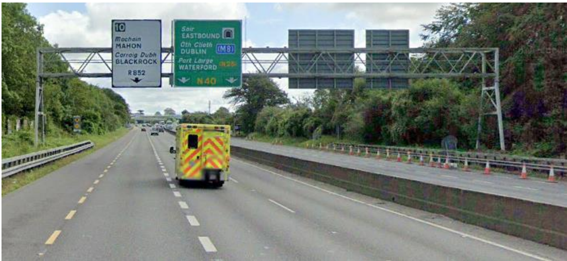
Existing gantry between Bloomfield and Mahon junctions to be replaced by 'ITS enabled gantry' incorporating Variable Message Signs