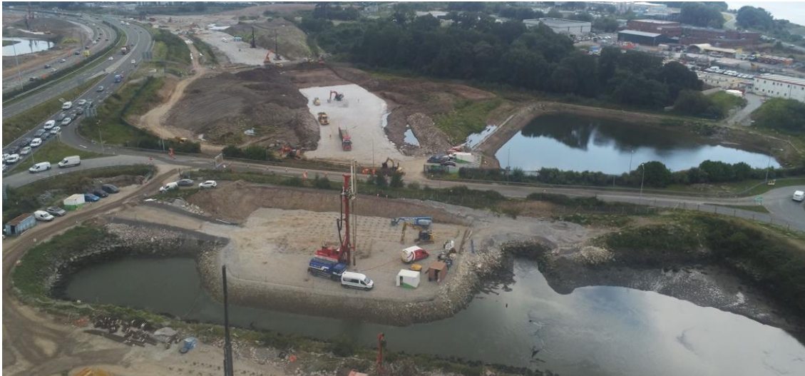
Ground improvement works being completed east of the Dunkettle Interchange Roundabout under Link C.