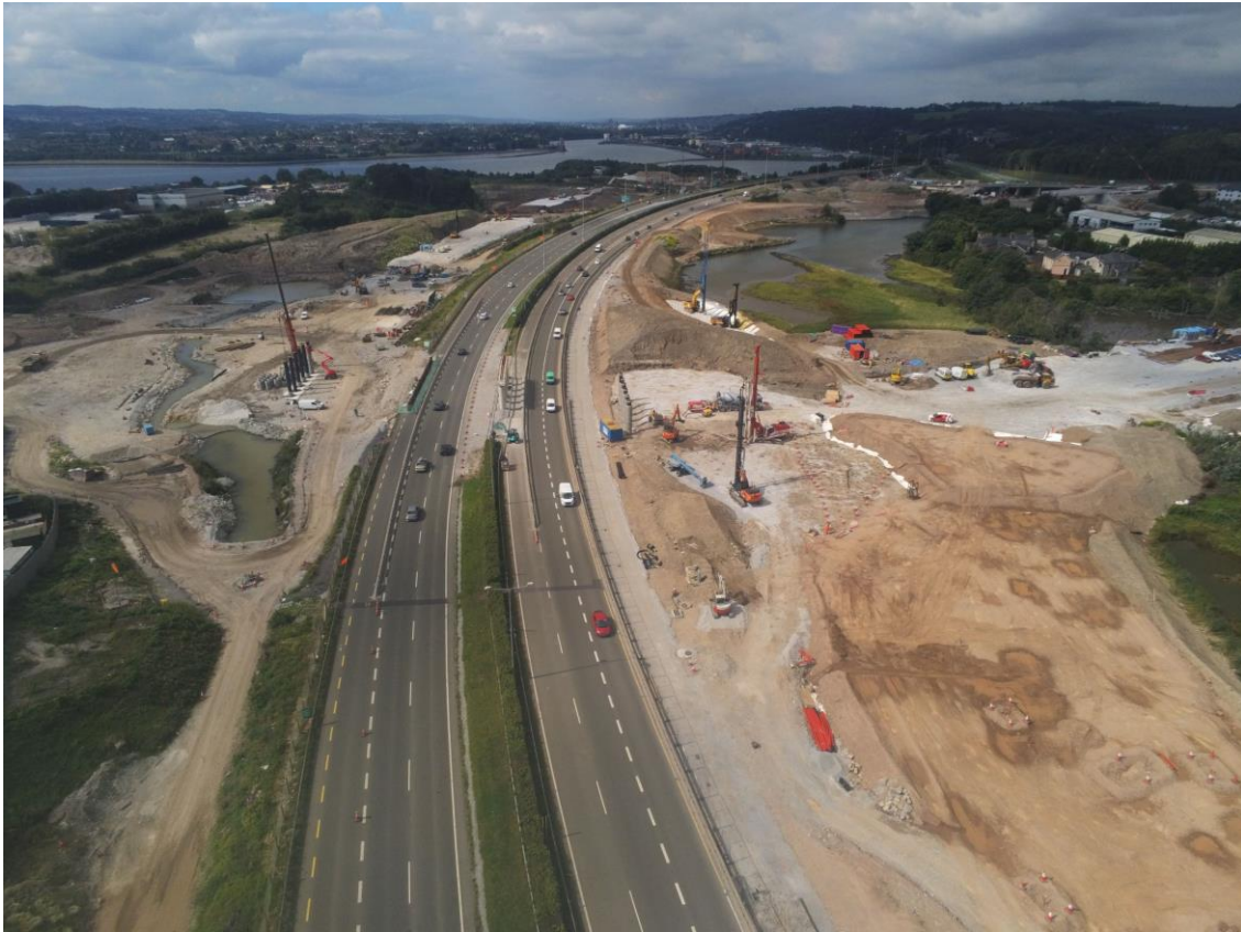
Ground improvement works being completed north of ST01 under the footprint of the proposed new roundabout.