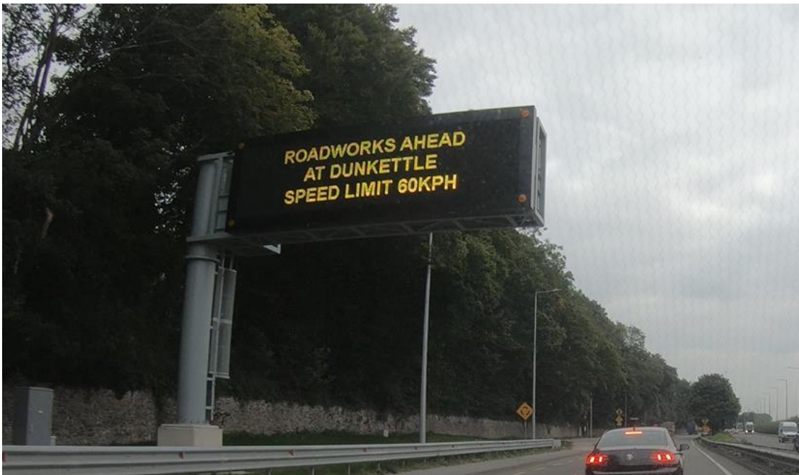
Recently commissioned variable message sign in operation on the N8 eastbound.