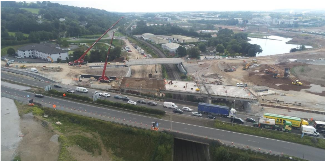
Works being completed at ST08 and ST09 alongside the M8.