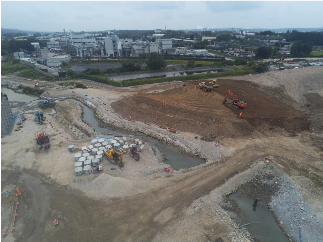
Ground improvement works being completed east of the Dunkettle Interchange Roundabout under Link C.