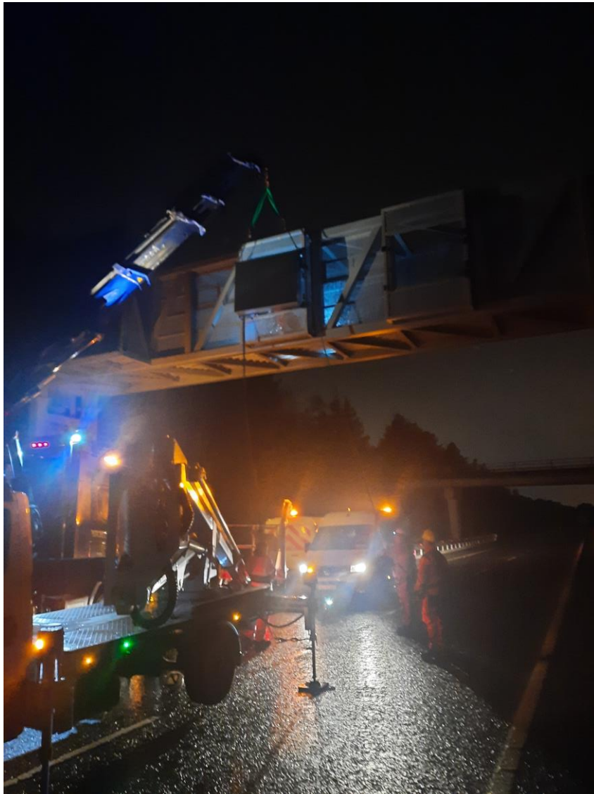
Lane Control Signs being installed on the M8 southbound.