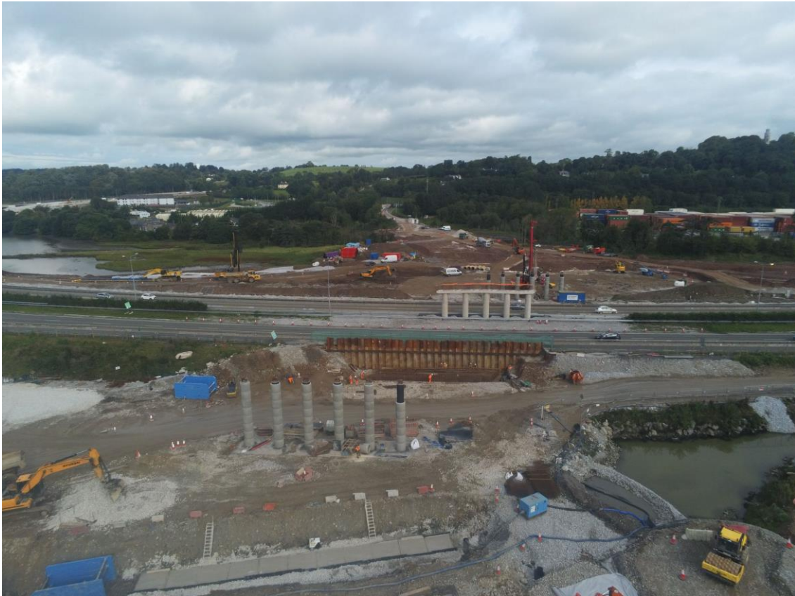
Ongoing works at ST01 south of the N25.