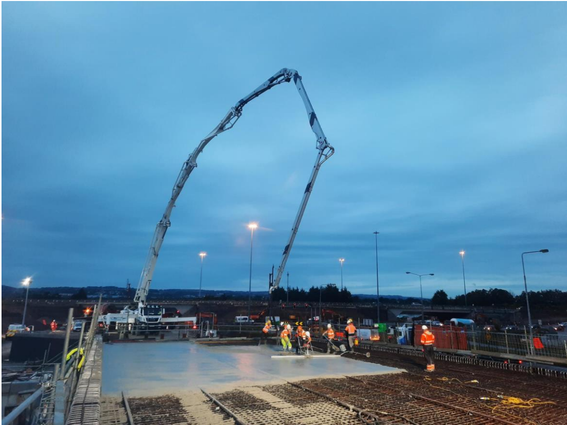
Concrete being poured for the ST08 bridge deck this morning.