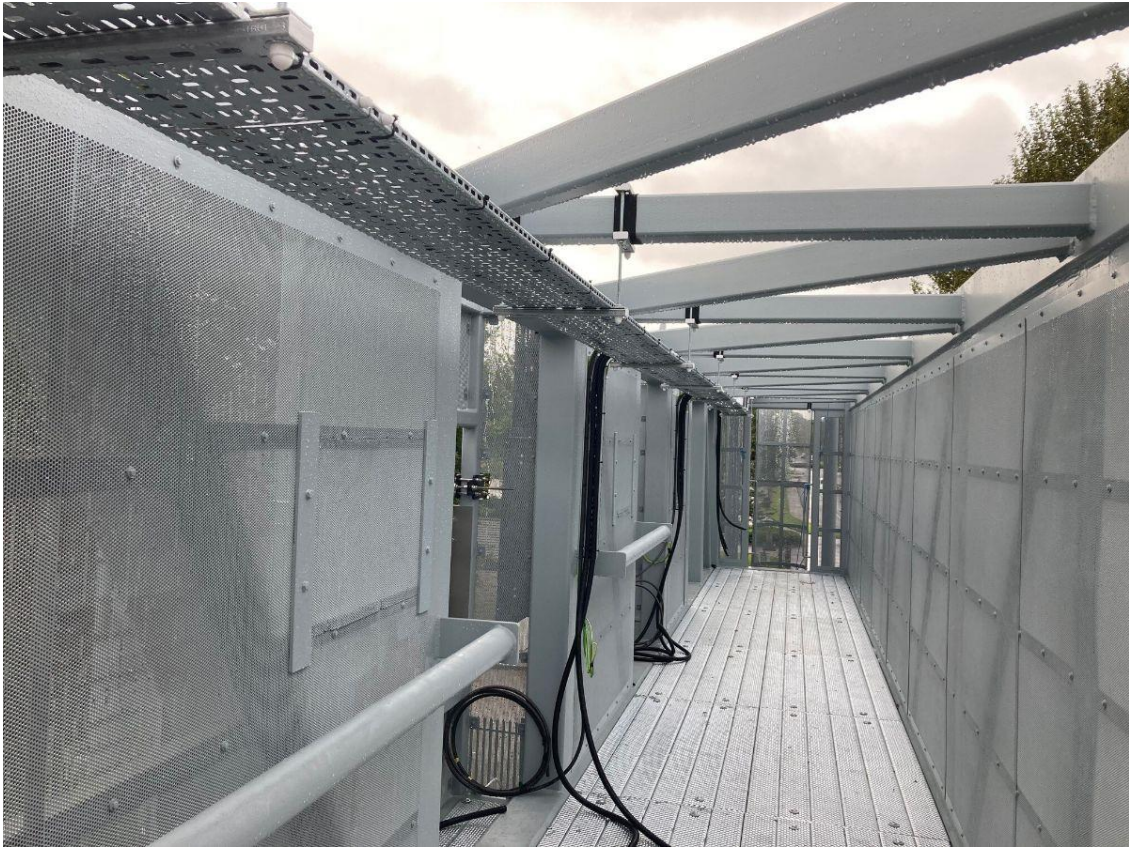
Cabling and fit-out of the gantry signage within the access walkway.