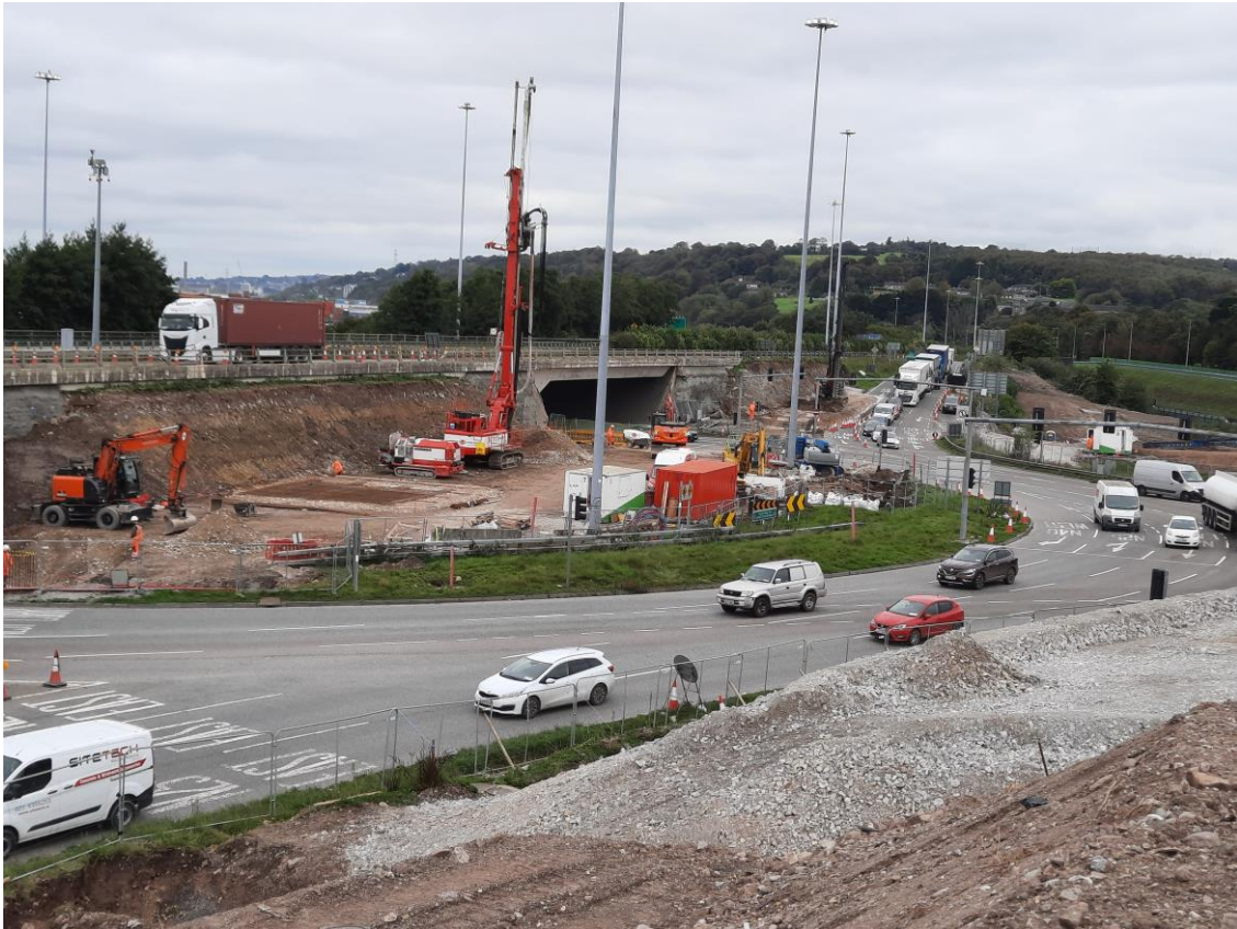
Piling works ongoing for the widening of the existing N25 embankment.