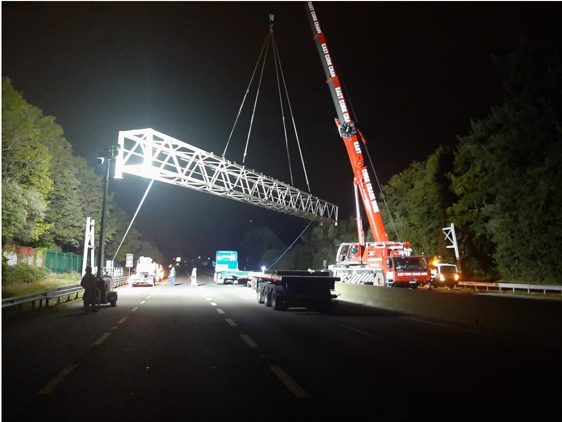
Gantry removal on N40.