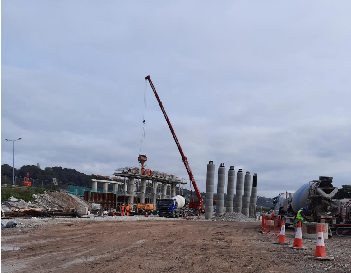
The crosshead for Structure ST01 being poured just south of the N25 westbound.

at the south central pier which will receive the beams - see photograph below.