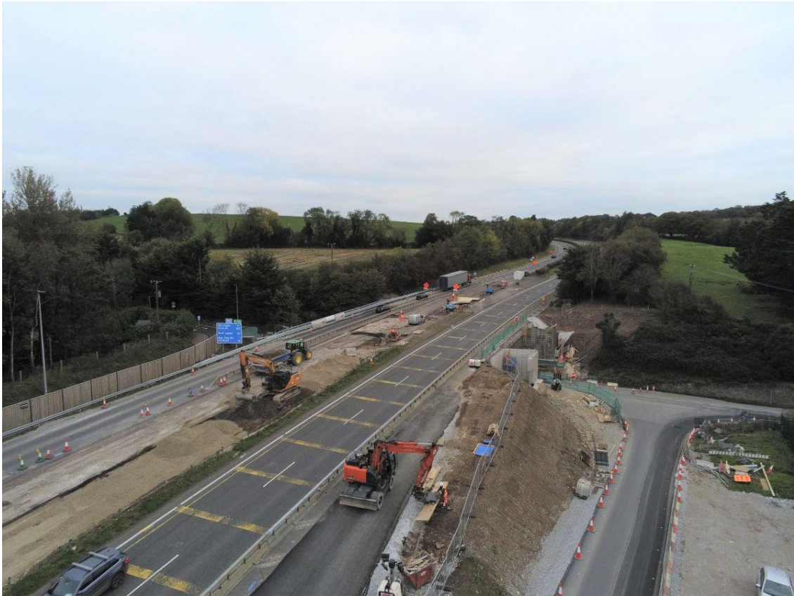
Works ongoing at Structure ST10 and the central median of the M8.