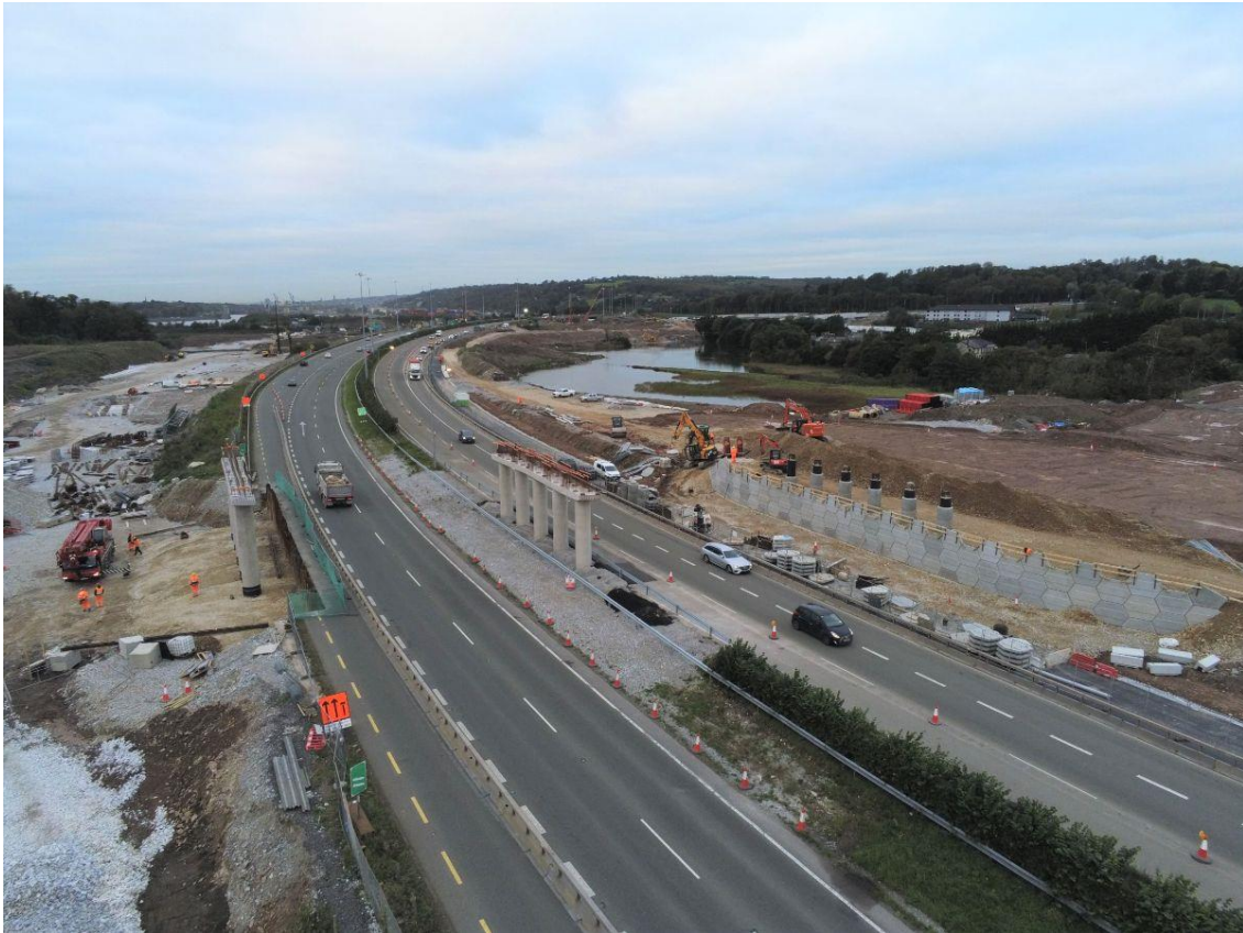
ST01 works ongoing in advance of the upcoming placement of beams.