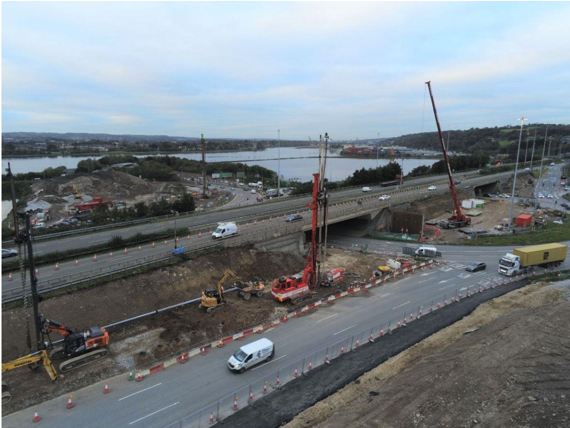
Piling works ongoing for the widening of the existing N25 embankment.