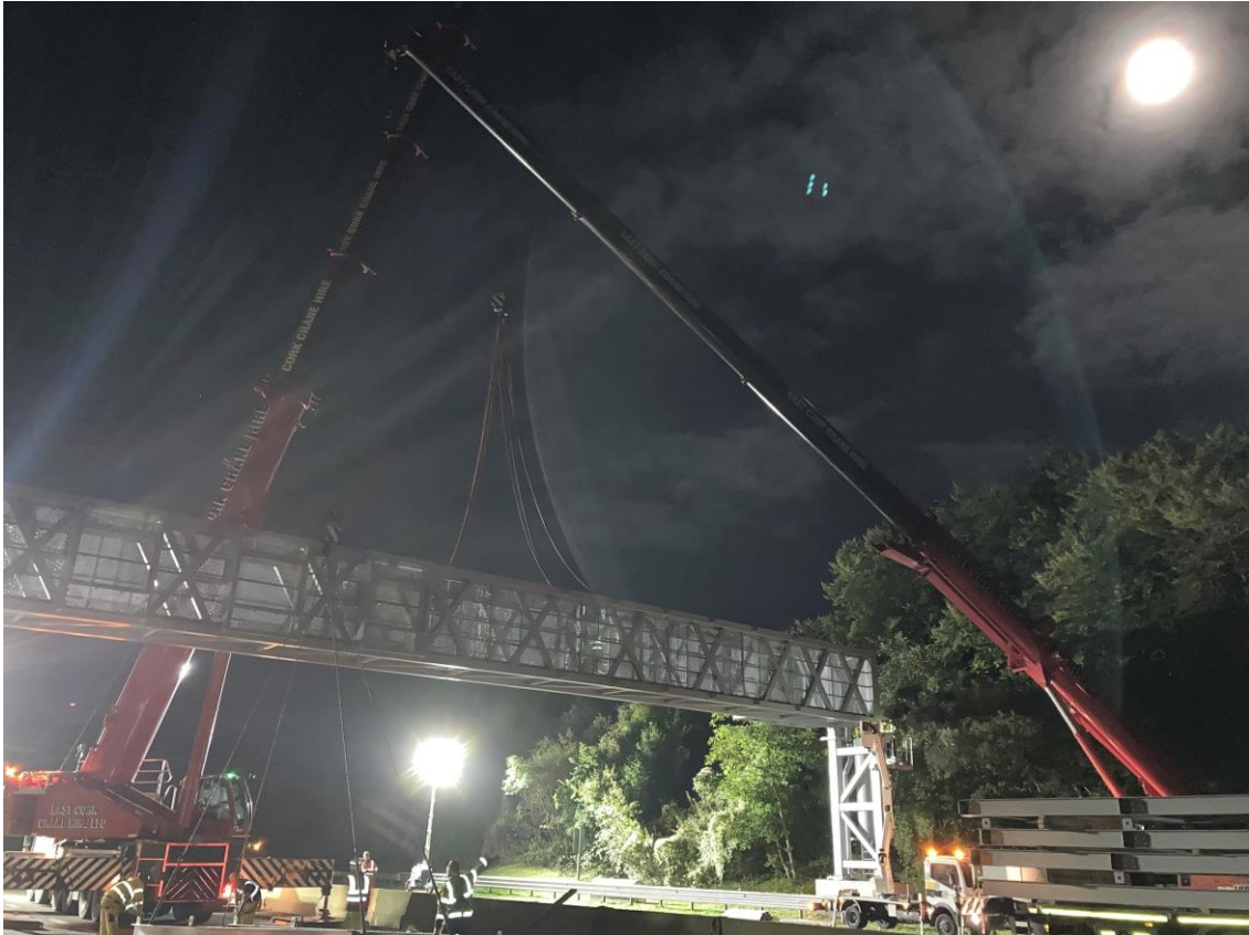
ITS Gantry Installation on the N40 between J9 Bloomfield and J10 Mahon

As always, if there are any queries or comments in relation to these works, please contact us at: