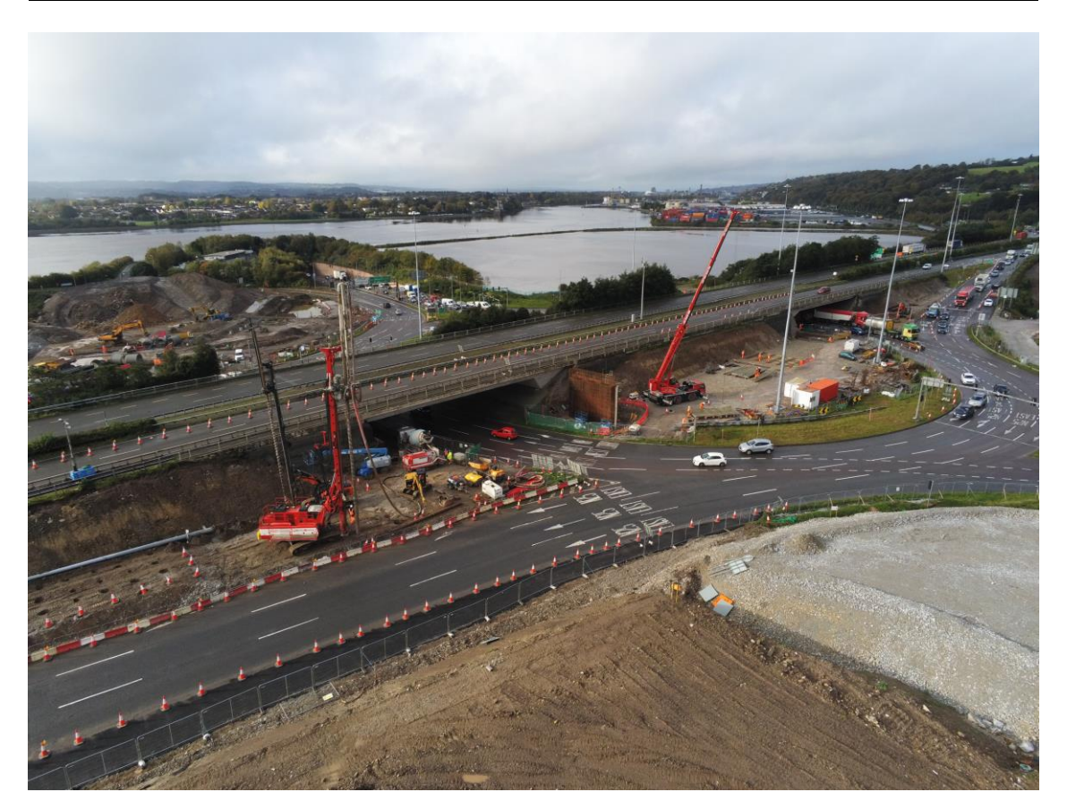
Ongoing piling works for the widening of the existing N25 embankment.

necessary. These works will continue for a further two weeks approximately. Further off peak lane restrictions / closures will be required in order to complete these works and details will continue to be provided to motorists as these works are progressed – see photograph below of the ongoing works.