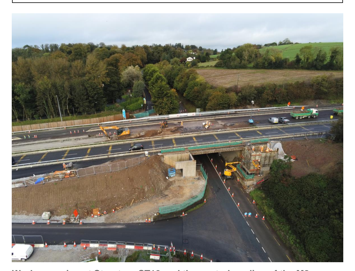
Works ongoing at Structure ST10 and the central median of the M8.

On Friday 5th November the precast beams will be placed at Structure ST10, this will require a local road closure of the L2998 from 22:00 to 05:00. Traffic will be diverted via the Dunketttle Roundabout and the N8/N25 to the Little Island Interchange from either approach.