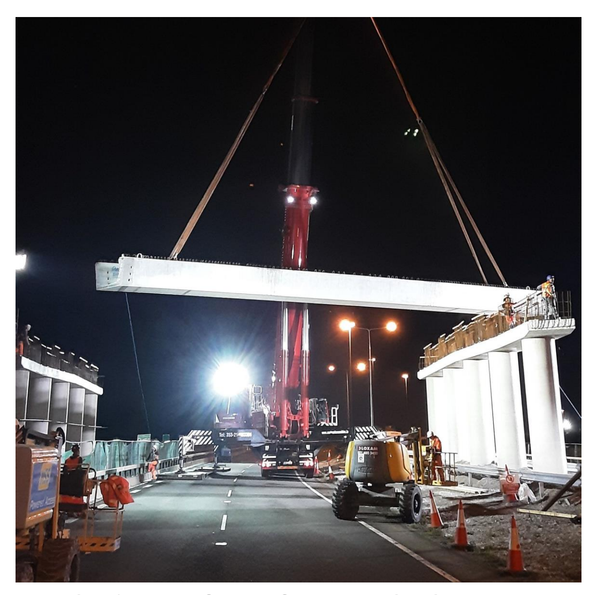
Installation of beams on Structure ST01 under a night time closure.

The M8 southbound will be closed at night from next Tuesday to Friday night (2nd to 5th November inclusive) from 22:00 to 05:00 in order to complete works for Structure ST10 and the hardening of the existing central median. Traffic will be diverted at Junction 18 via the R639 through Glanmire village.