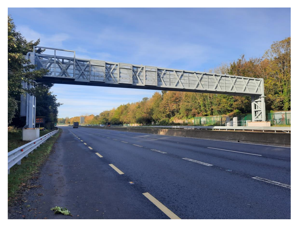
Super span gantry in place spanning the N40.

As always, if there are any queries or comments in relation to these works, please contact us at: