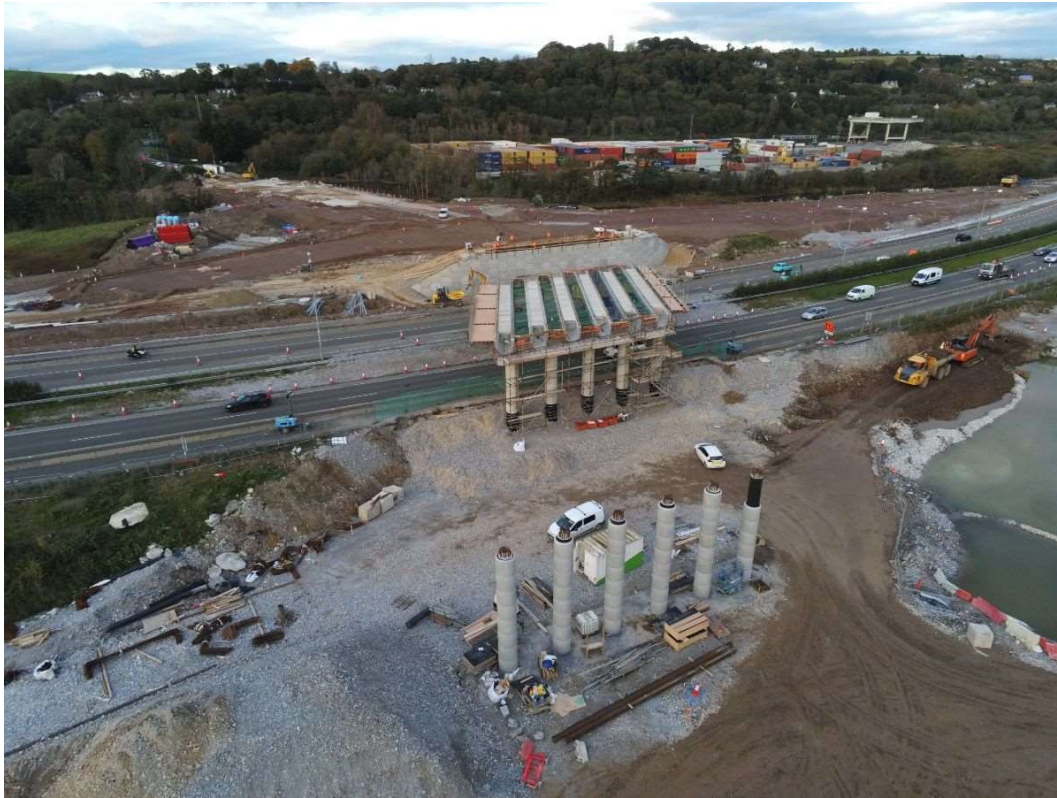
Precast concrete beams in place over the N25 westbound for Structure ST01.