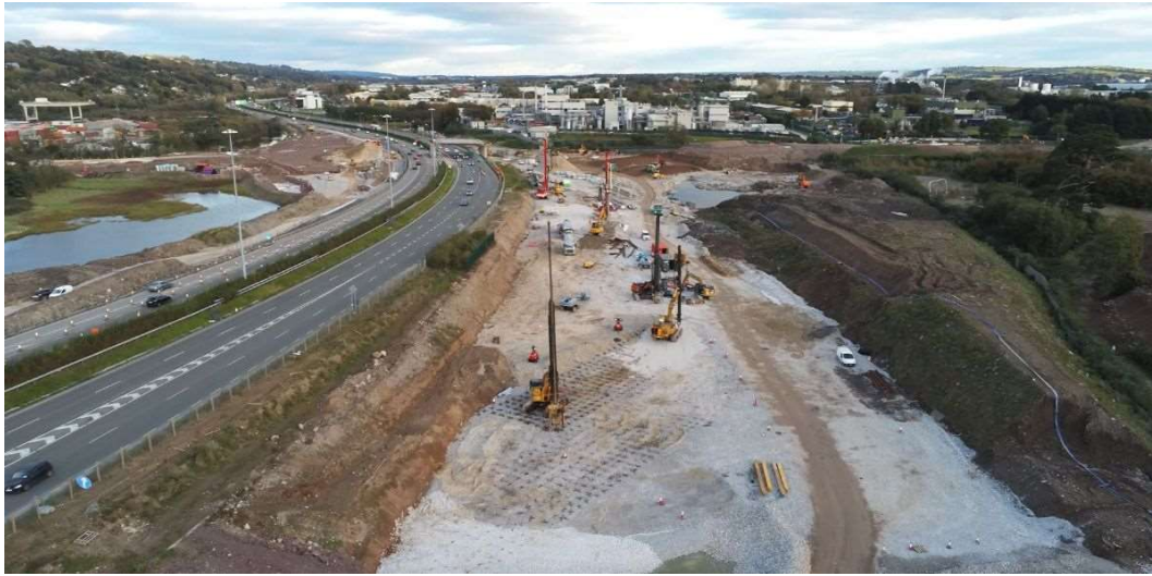
CMC Ground Improvement works ongoing for the new Link roads Link L & Link M just south of the N25 westbound.