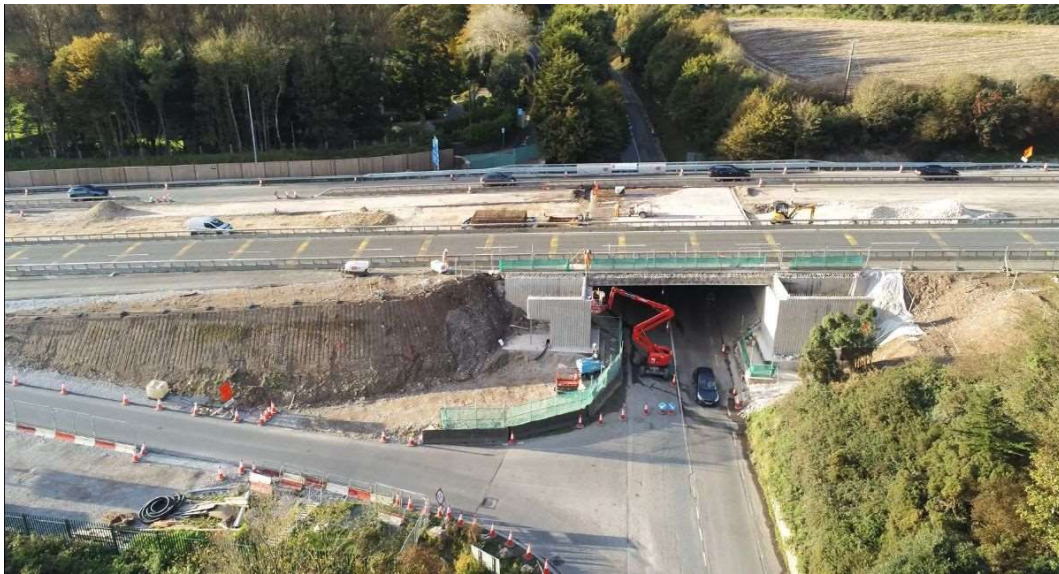
Works ongoing at Structure ST10 ahead of the upcoming beam placement.