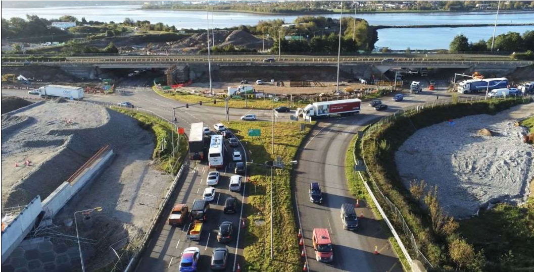
Construction works ongoing for Structure ST07 within the Dunkettle Interchange Roundabout.

works are progressed – see photograph below of the ongoing works.