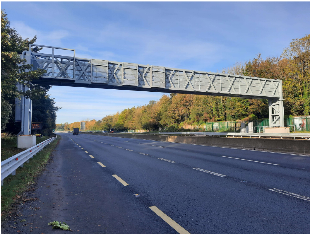
Super span gantry in place spanning the N40.