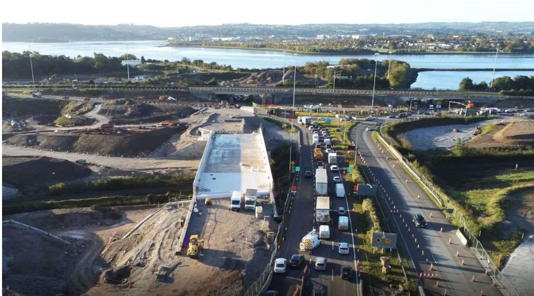
Waterproofing works being undertaken at Structure ST08 alongside the M8 southbound.