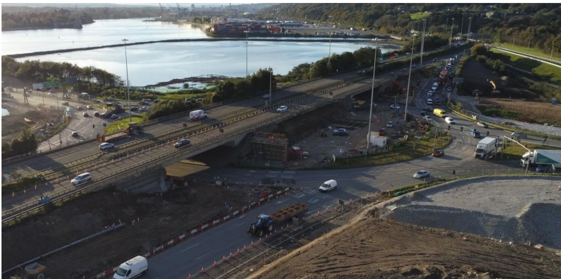
Construction works ongoing for Structure ST06 within the Dunkettle Interchange Roundabout.