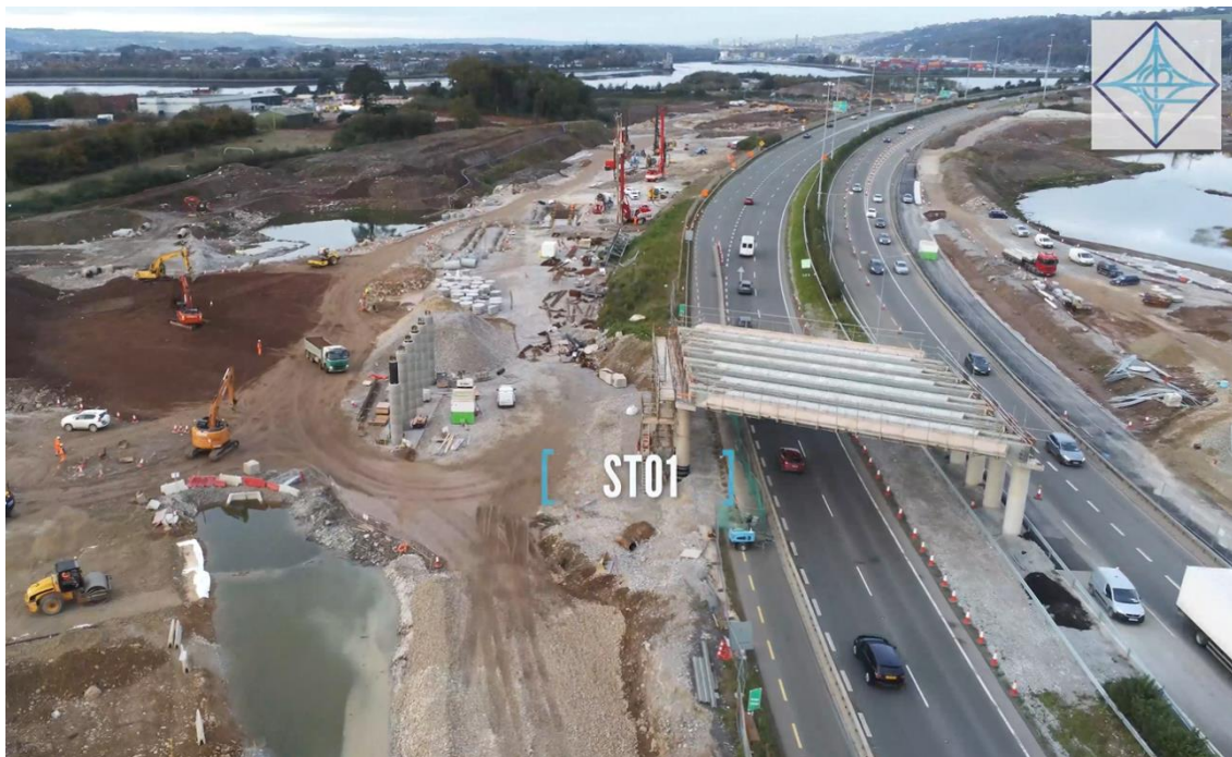
Works ongoing at Structure ST01 ahead of the upcoming beam placement.