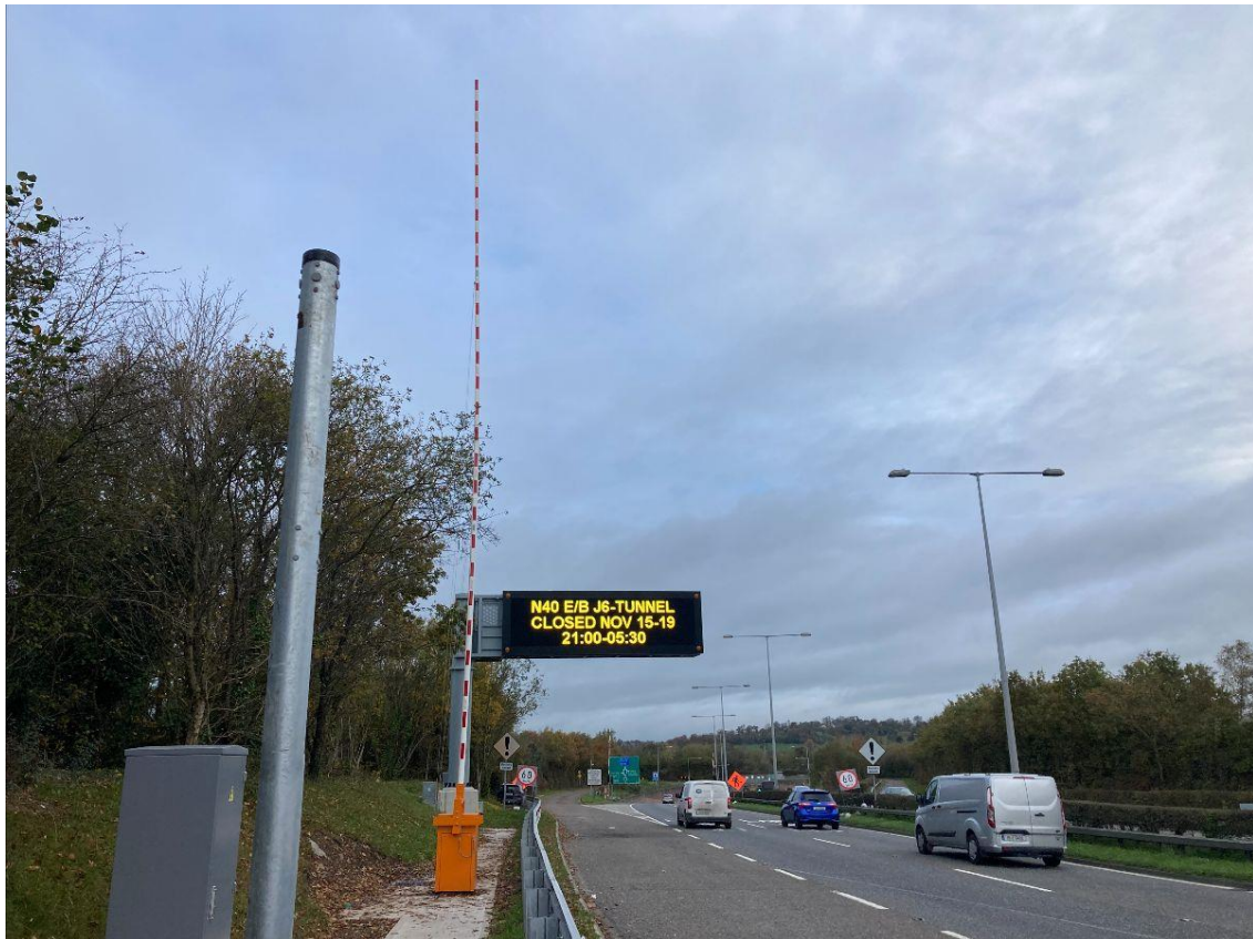
Automatic barrier installed on the N40 eastbound recently.

As always, if there are any queries or comments in relation to these works, please contact us at: