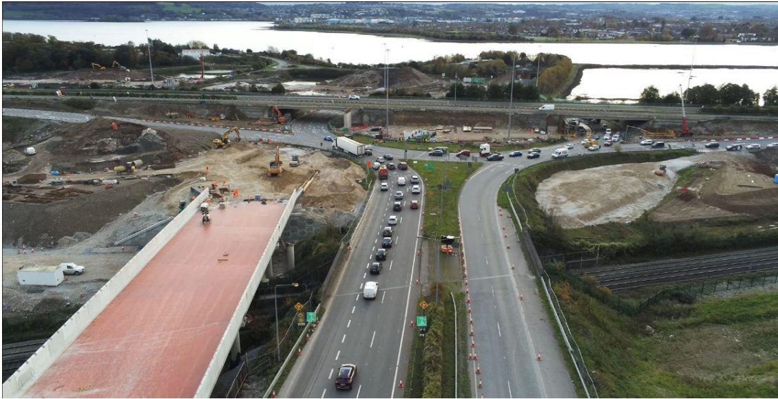
Construction of the new Link D road alignment ongoing just south of Structure ST08.