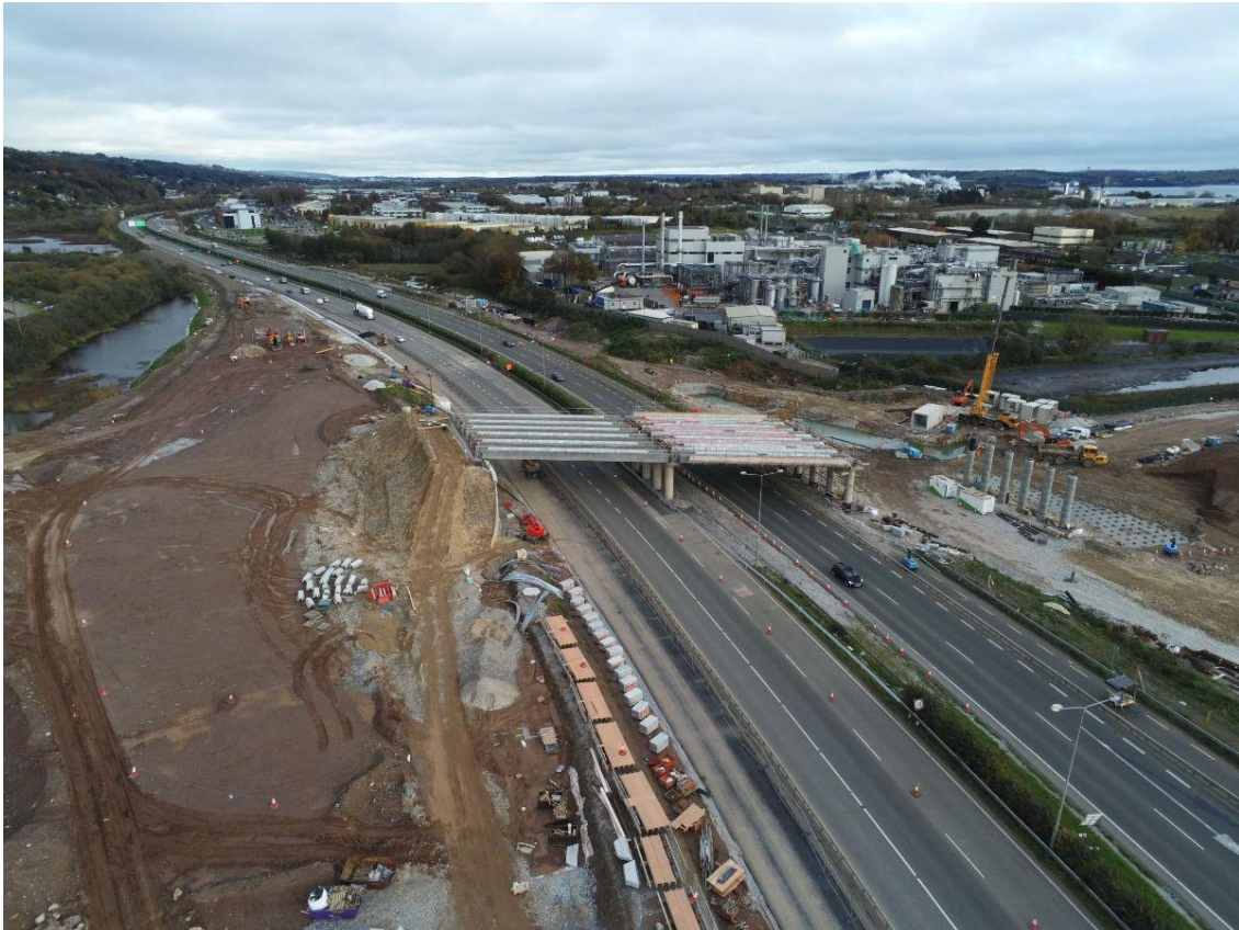
Works ongoing at Structure ST01 with the central and northern spans now in place over the existing N25.