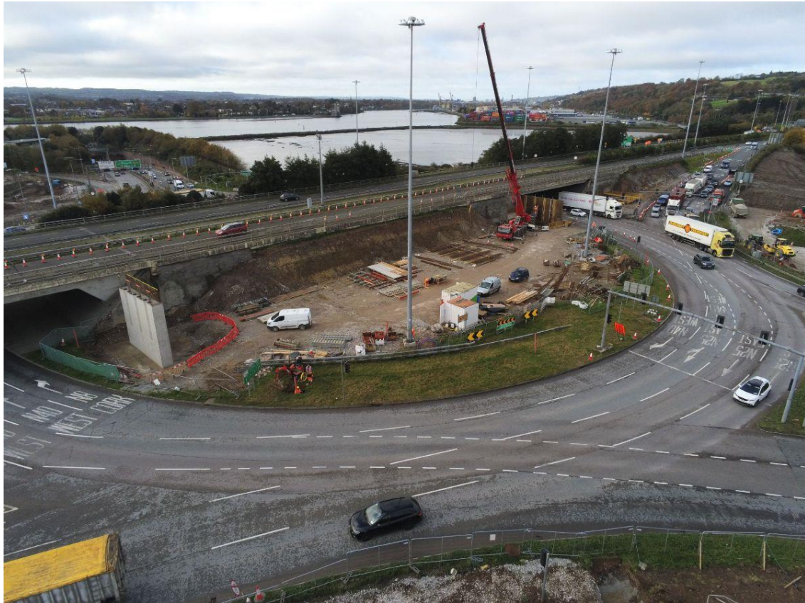
Construction works ongoing for Structure ST06 & ST07 within the Dunkettle Interchange Roundabout.