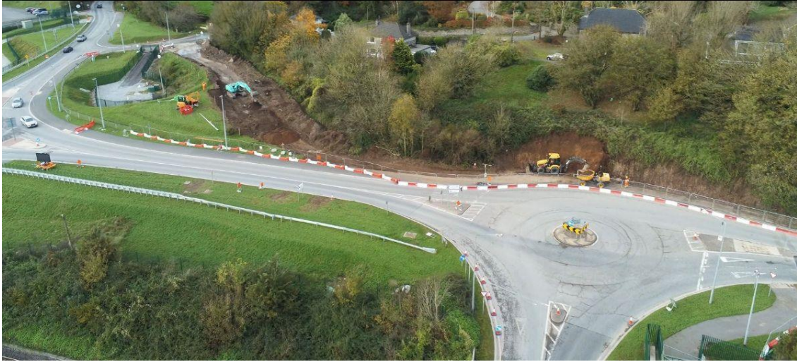
Construction works for the new cycleway ongoing at the Burys Bridge Roundabout.