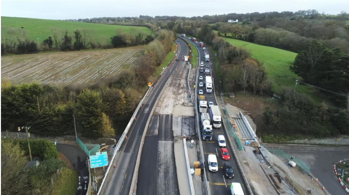
Works ongoing at Structure ST10 on the M8 southbound.

December in order to facilitate the pouring of the new bridge deck of ST10. Local diversions will be in place. – see photograph below.