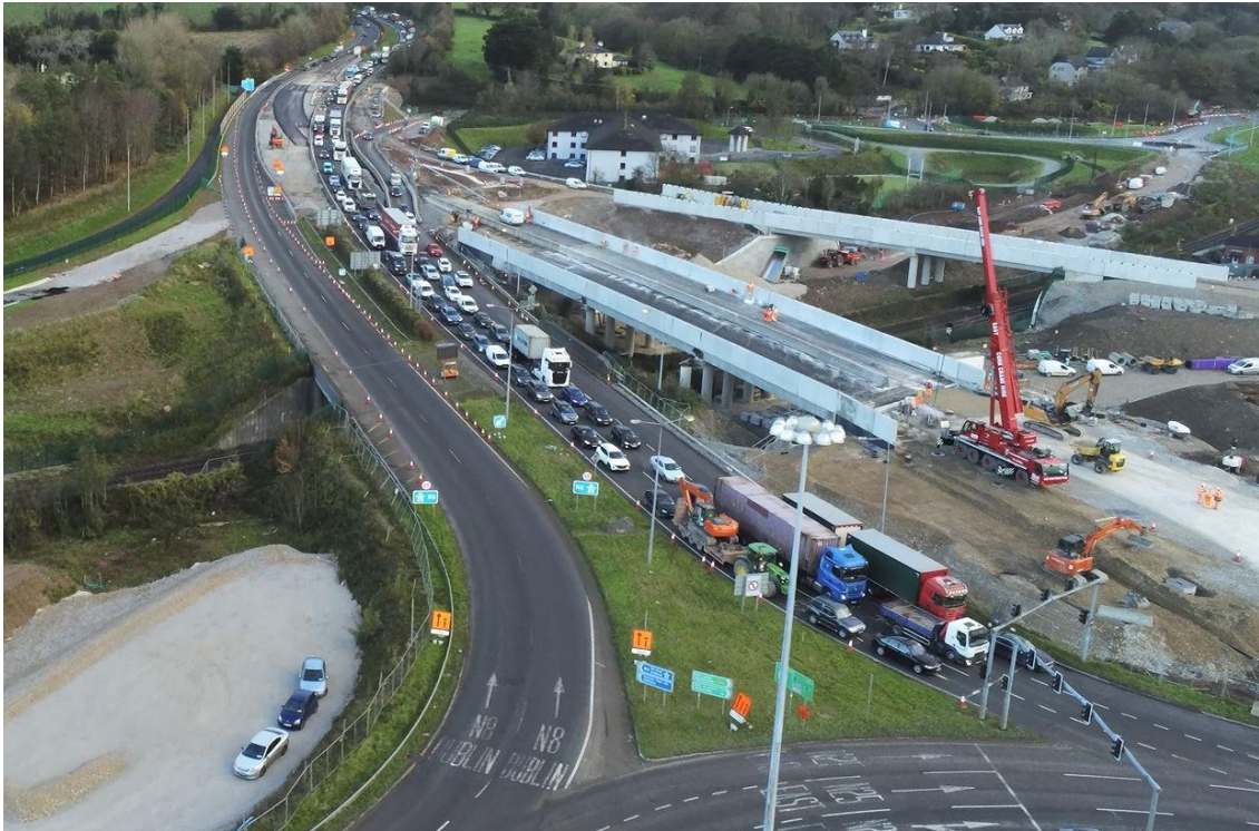
Installation of concrete parapets at the southern side of ST08 ongoing.