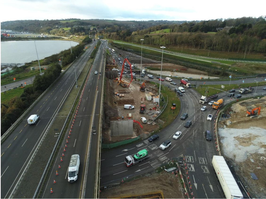
Construction works ongoing for Structure ST06 & ST07 within the Dunkettle Interchange Roundabout.