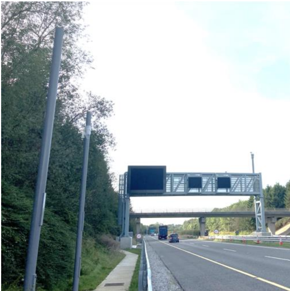
Roadside poles on M8 approach awaiting install of OHVD Equipment.