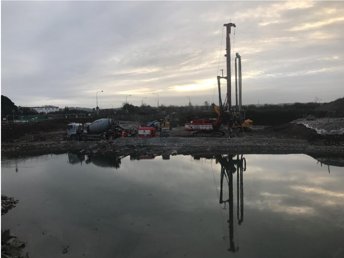
CMC ground improvement works ongoing for Link C within the existing pond area.