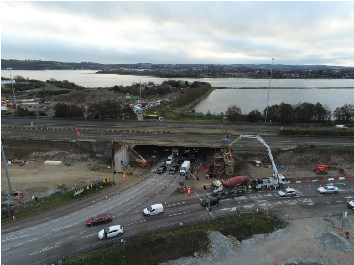
Works ongoing at Structure ST06 with the western abutment wall being poured ahead of the upcoming beam placement.