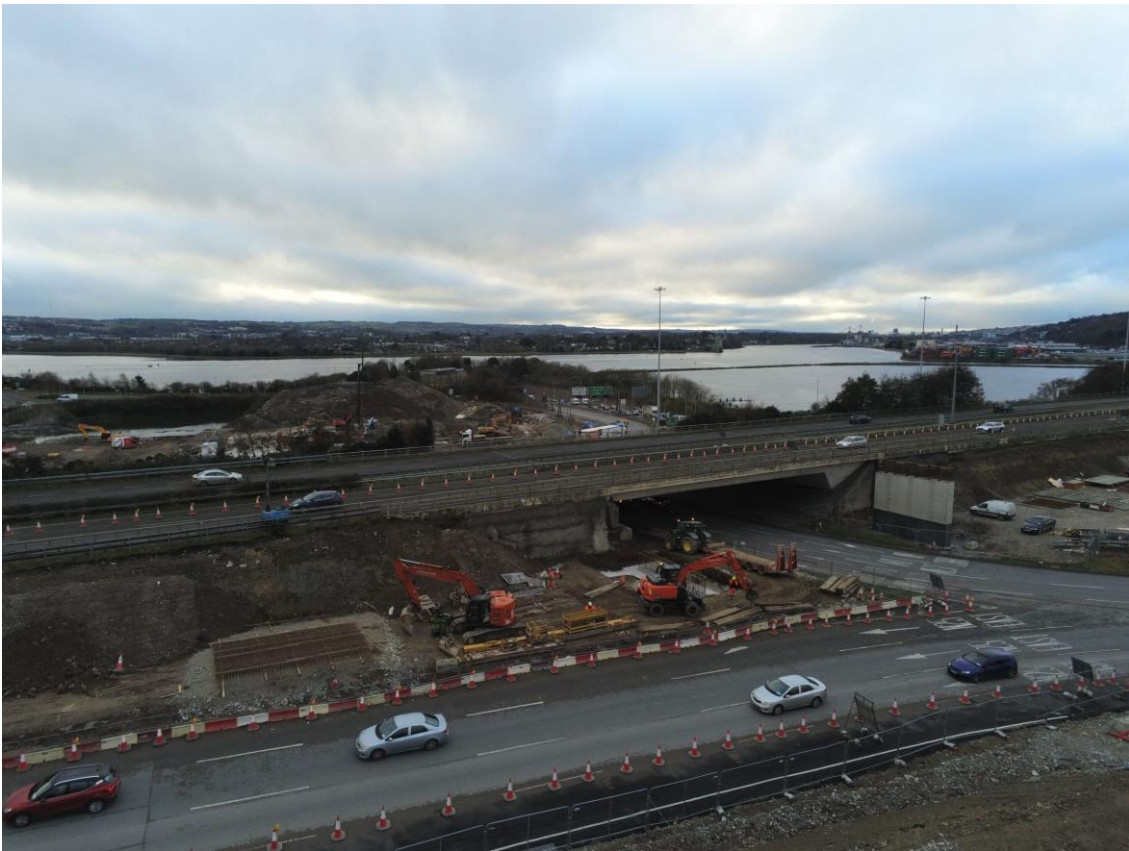
Works ongoing at Structure ST07 for the eastern abutment wall.