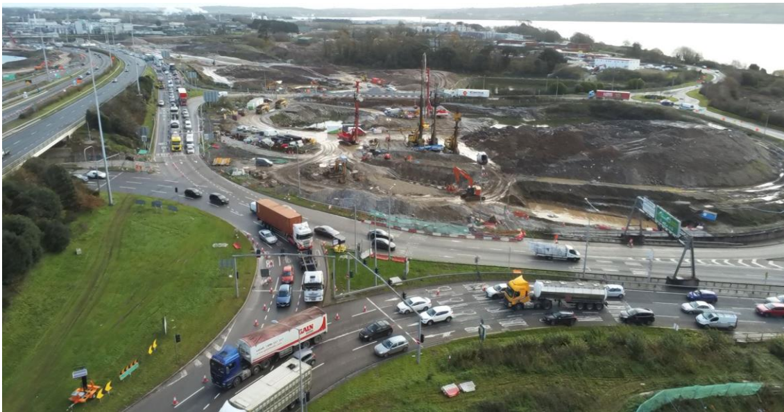
Works being progressed at the location of ST05 offline.