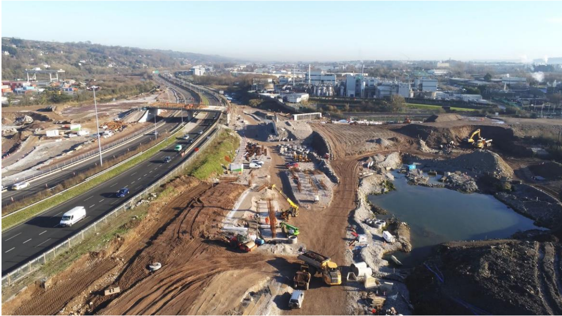
Embankment construction ongoing south of the N25.