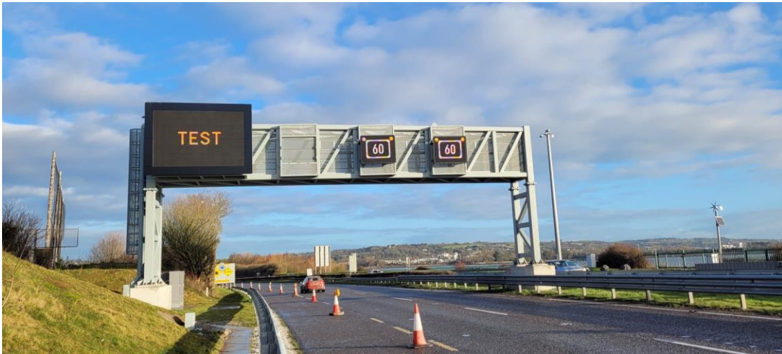
Electronic Signage under test on eastbound N40 approach to Jack Lynch Tunnel.

the detection of an overhead vehicle prompts the display of advisory speed limits on the approach to the tunnel.