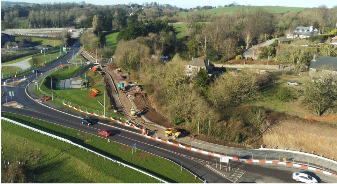
Cycleway Works ongoing.

Please see hereunder link to recent drone footage showing the ongoing works on the deck of ST01: