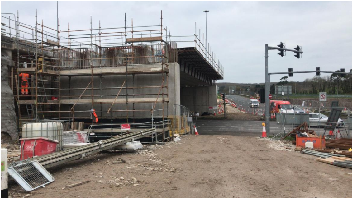
Works ongoing at St06.