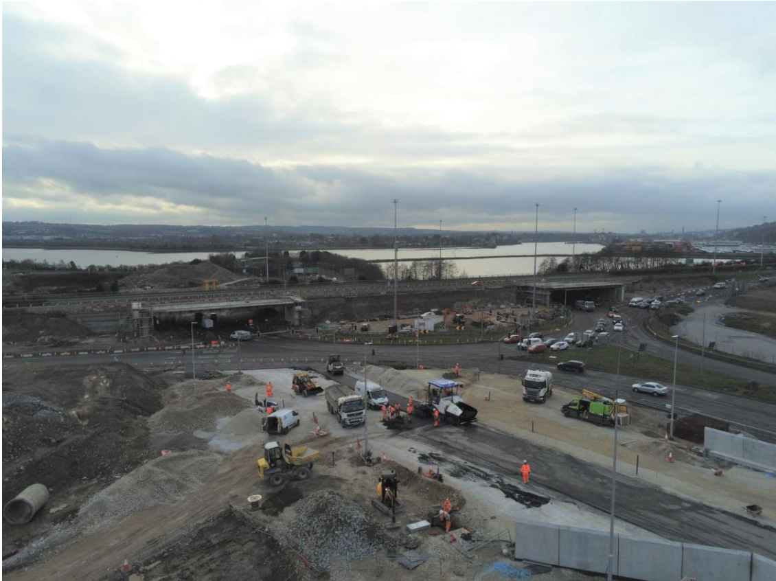
Surfacing works for new M8 Southbound lanes underway at the Interchange Roundabout.

over the next few days as we head towards opening of the new Structure ST08 on Sunday the 30th January 2022.