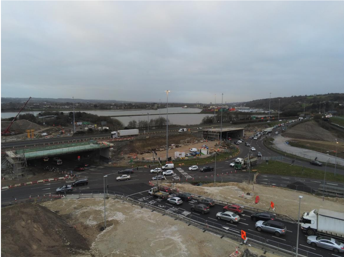
Traffic from the M8 southbound approaching the DK1 roundabout on the new road alignment.