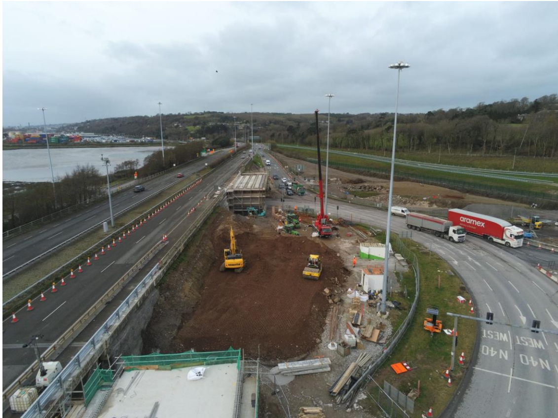
Construction of Link F ongoing within the Dunkettle Interchange Roundabout.