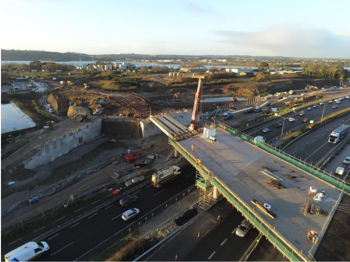
Beam placement works ongoing for the last bridge deck of Structure St01.