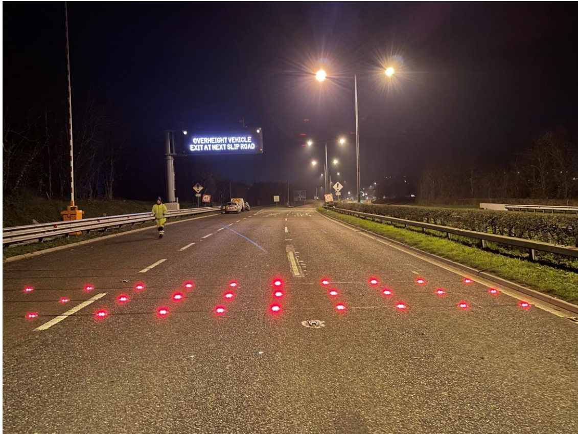
Upgraded tunnel protection systems in response to Over-height Vehicle detection under test on the N40.

As always, if there are any queries or comments in relation to these works, please contact us at: