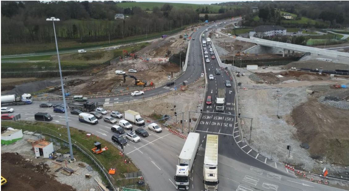
The new road layout at the interface between the M8 and the Dunkettle Interchange Roundabout.