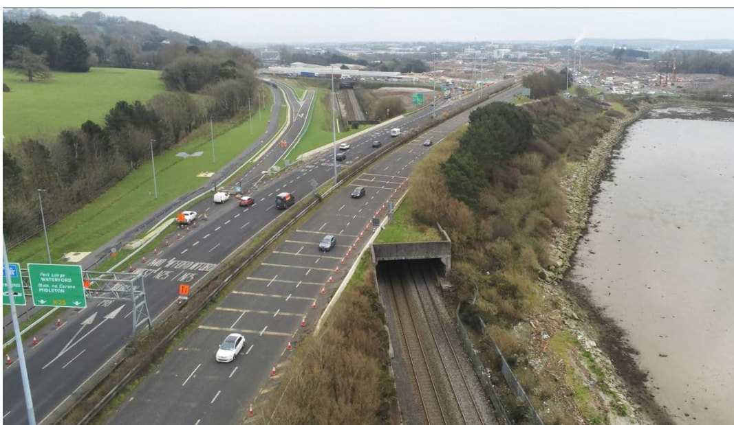
Link U tie in to the existing N8 eastbound.

Similarly, we still hope to open Link U before the end of March 2022. In order to facilitate this there will be a significant focus on the works for Link U (as shown in purple on the plan above) – this will include night time and weekend working over the next few weeks starting from next Monday 7th March 2022 - see photograph below.