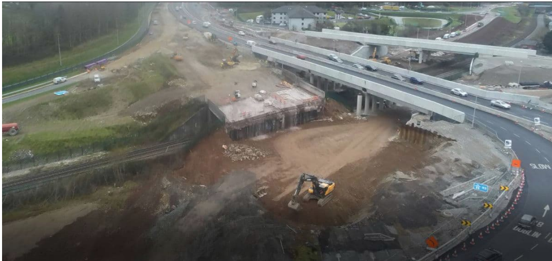
Demolition of the existing bridge alongside the recently opened Structure St08.

The demolition of the existing railway bridge is continuing at night – see photograph below.