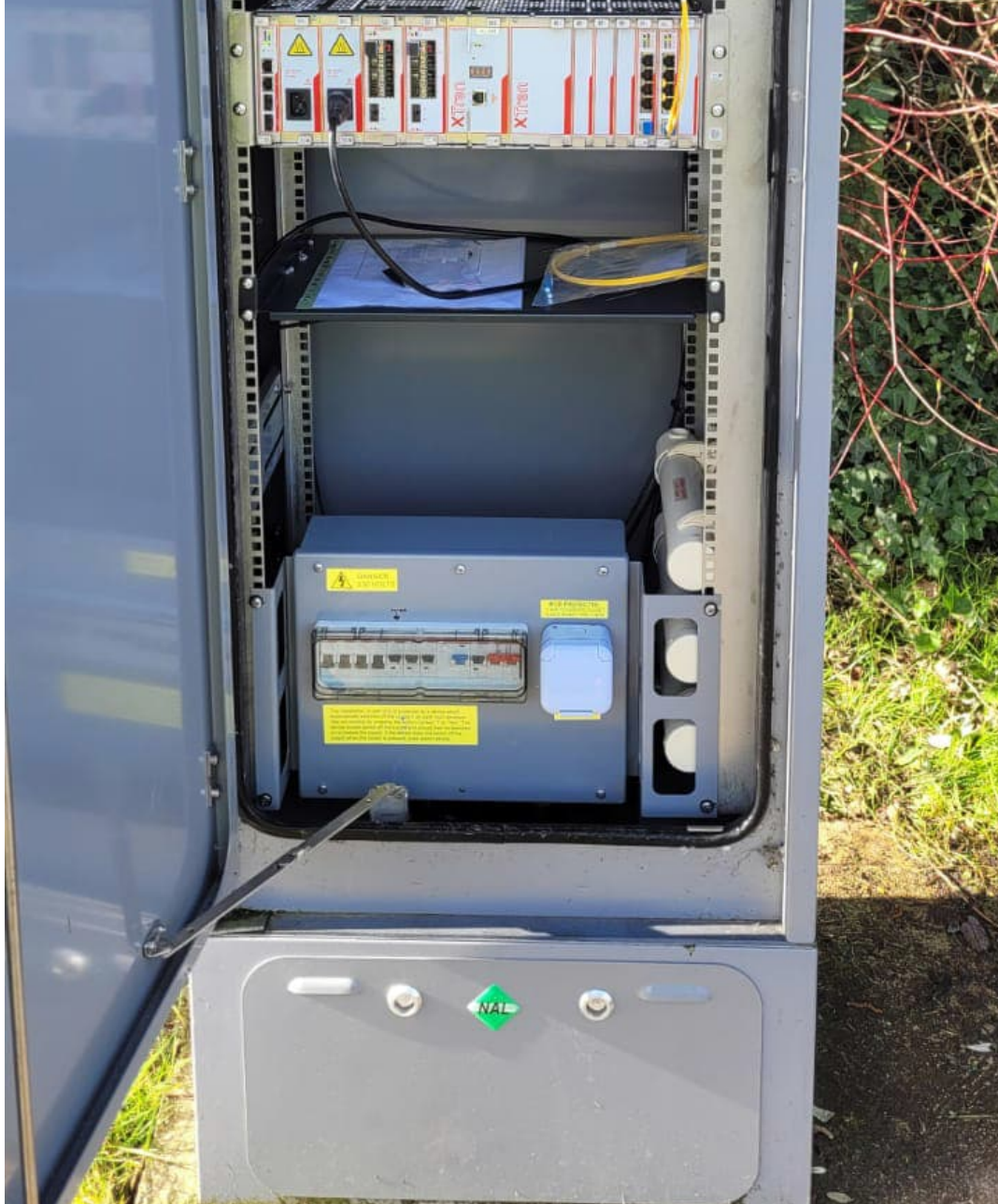
An example of the Fibre Optic technology installed as part of the Dunkettle Advanced ITS project

As always, if there are any queries or comments in relation to these works, please contact us at: