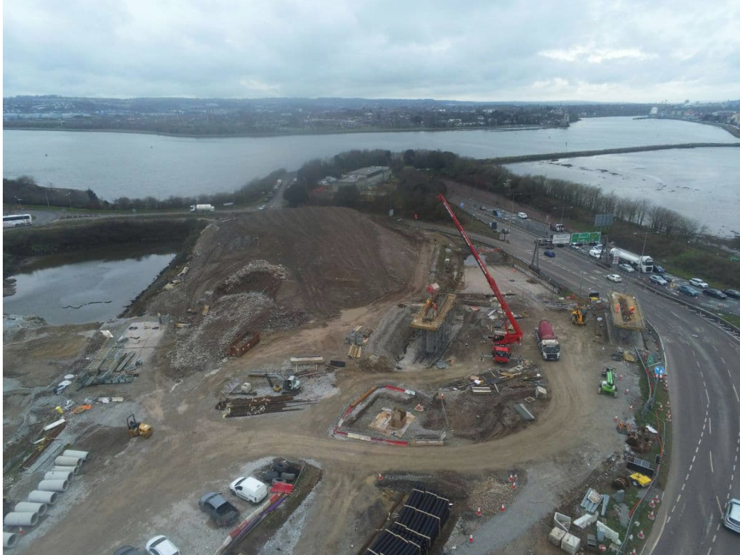
Works ongoing on site for the construction of Structure St05 alongside the Dunkettle Interchange Roundabout.

Similarly, we still hope to open Link U before the end of March 2022. In order to facilitate this there will be a significant focus on the works for Link U (as shown in purple on the plan above) – this will include night time and weekend working over the next few weeks starting from next Monday 7th March 2022 - see photograph below.