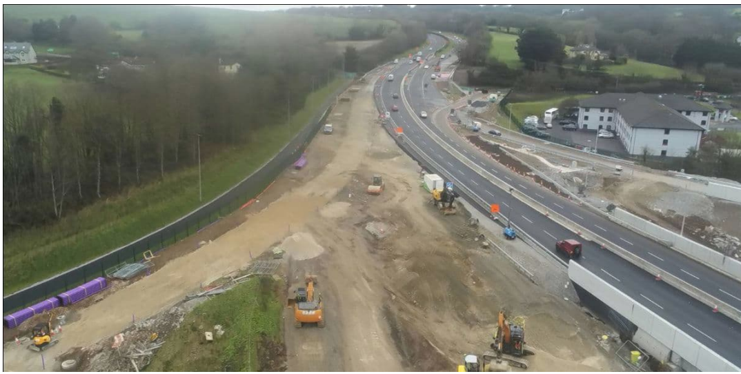
Tie in works being prepared for the Link U tie in with the M8 northbound.

The demolition of the existing railway bridge is continuing at night – see photograph below.