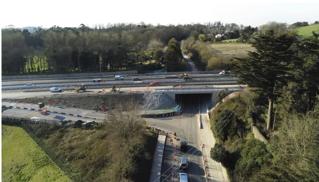
Works ongoing for the new cycleway on the L2998, under the M8.

We still hope to complete the works on the cycleway on the L2998 between Burys Bridge and Dunkettle by the due completion date of May 2022 – see photograph below.