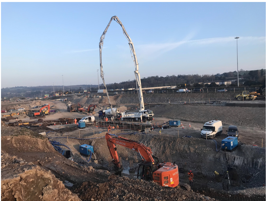
Works ongoing at Structure 3 south of the N25.

As part of the works in this area, construction is now well underway at Structures 1-4 inclusive - see photograph below.