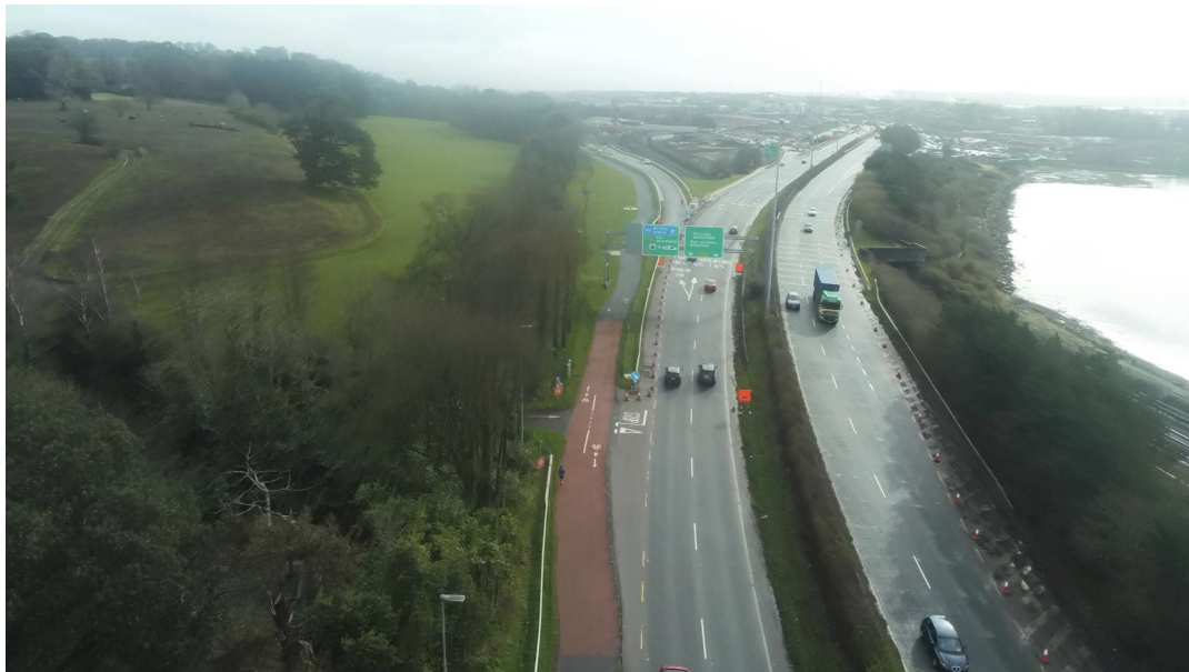
Pavement tie in works area for Link U to the N8/N25 eastbound .

are now proposing to take advantage of the reduced traffic volumes during the upcoming Easter school holiday period to facilitate these works. Preliminary works will get underway immediately under night time working. We then expect that lane restrictions will be in place for approximately 1 week from Friday 8th April 2022 to Saturday 16th April 2022. Further details will be provided in next weeks update – see photograph below.