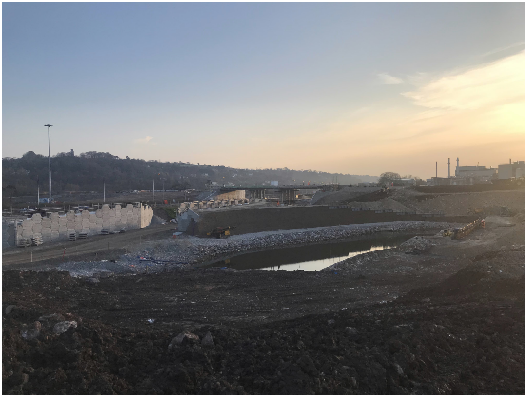
Embankment Construction works ongoing alongside the N25 westbound

As part of the works in this area, construction is now well underway at Structures 1-4 inclusive - see photograph below.