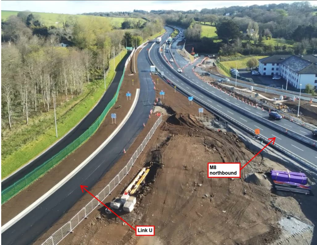
Finishing works ongoing on site at the northern tie in of Link U with the M8 northbound.

Motorists on the N25 will notice construction traffic utilising the new Structure St01 from W/C 11th April 2022 – see photograph below.