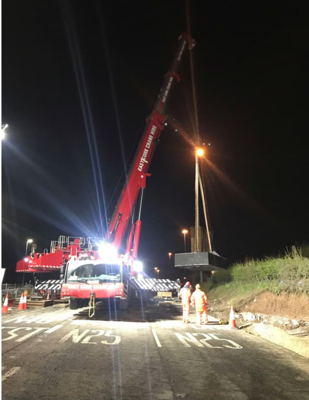
Installation of a precast gantry foundation in the central median of the N25 eastbound.

Following on from next week's work, we hope to open the free flow Link U (highlighted in red on the plan above) during W/C 18th April 2022. Opening details will be provided in next week's update – see photograph below.