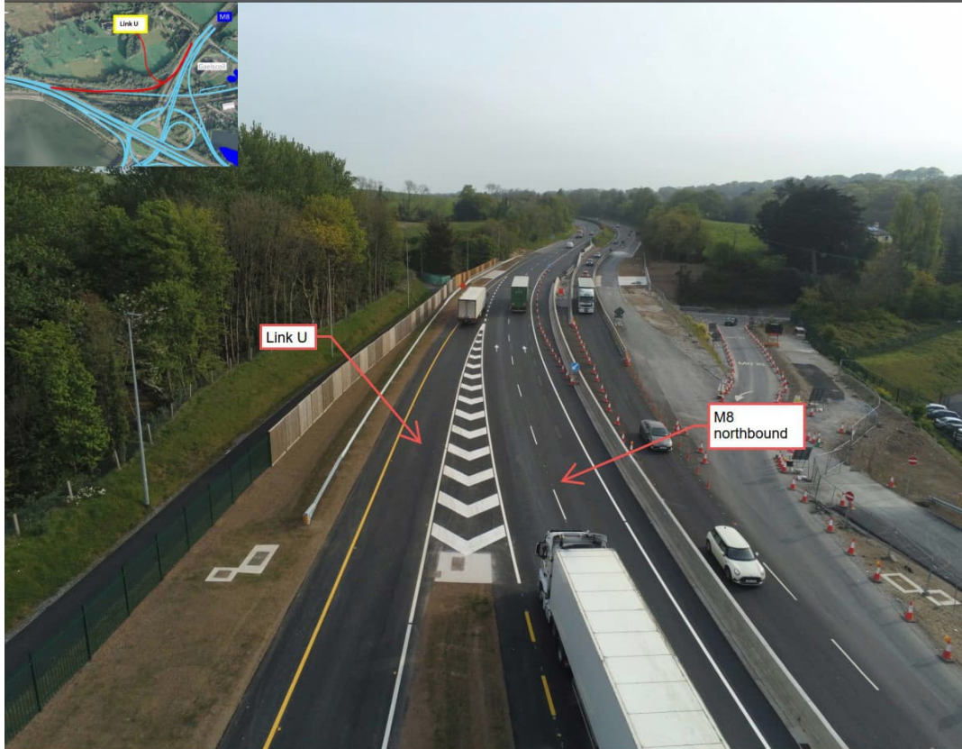
Traffic from Link U merging with the M8 northbound.

At Structure St01, works are progressing on the bridge deck – see photograph below. We expect that this structure will be opened to construction traffic over the coming days.