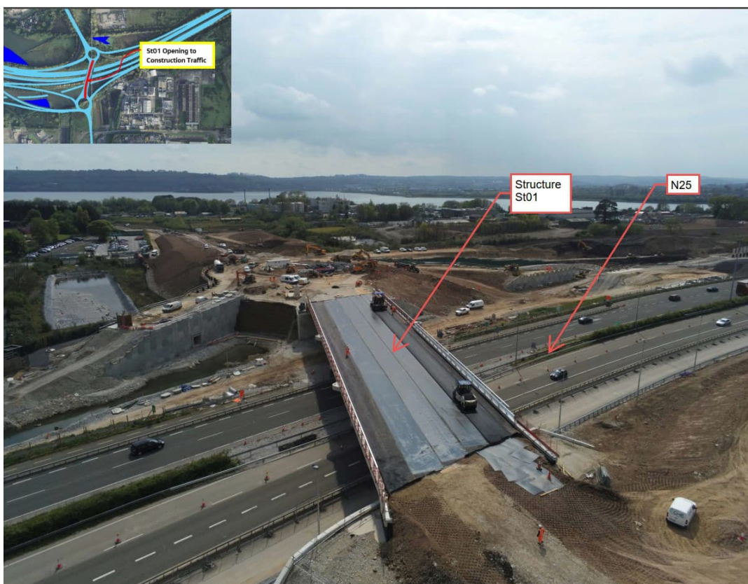
Installation of surfacing ongoing at Structure St01 over the N25.

At Structure St01, works are progressing on the bridge deck – see photograph below. We expect that this structure will be opened to construction traffic over the coming days.