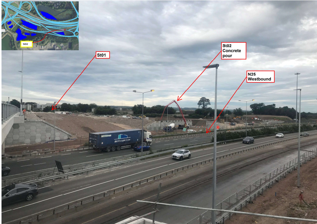
St02 works ongoing alongside the N25 westbound.