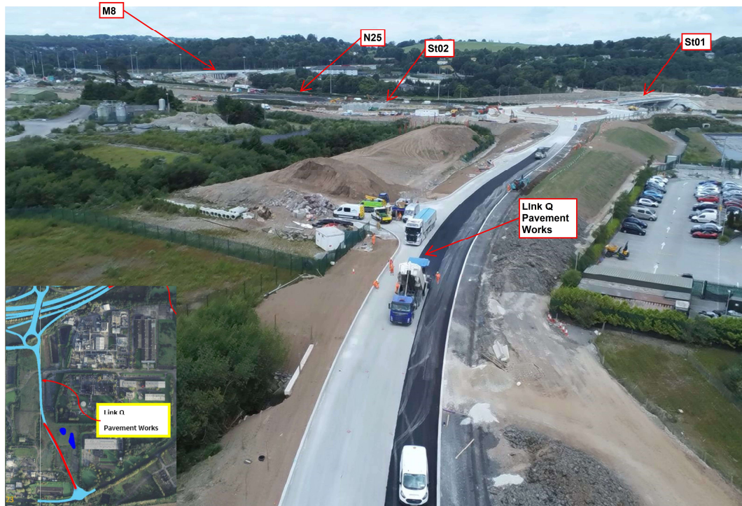
Pavement works ongoing at Link Q.