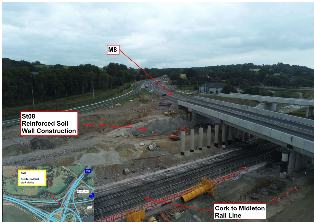
Reinforced soil wall construction works ongoing at St08 alongside the M8 northbound.