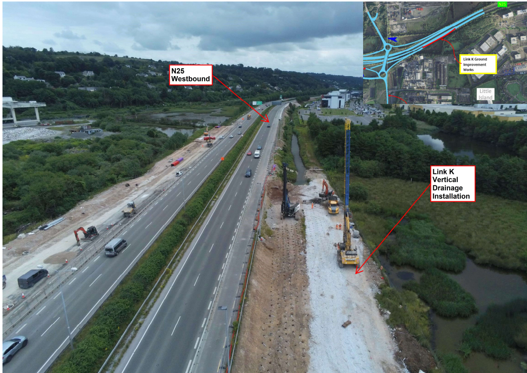
Vertical drainage installation ongoing alongside the N25 westbound.

This weeks progress update video shows ongoing pavement works on Link Q1, connecting the R623 Little Island with the N25