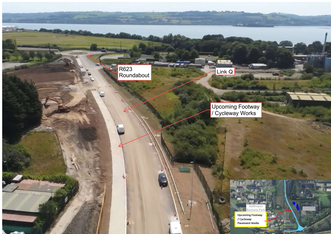
Works being progressed at Link Q.