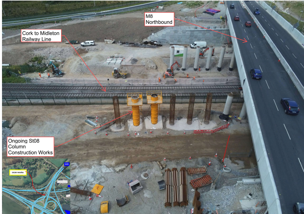
Column construction works at St08 ongoing.