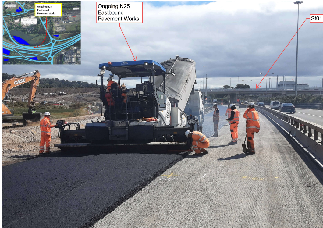
Pavement works ongoing alongside the N25 eastbound.