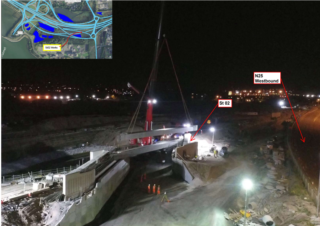
Bridge beams being placed at ST02 alongside the N25 Westbound.