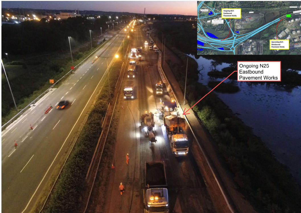
Pavement works ongoing at night on the N25 eastbound.

18th of August 2022 in order to install the temporary safety barriers which allow the works to be progressed in the central median of the N25. The works are being carried out at night to minimise the disruption to traffic – see photograph below.