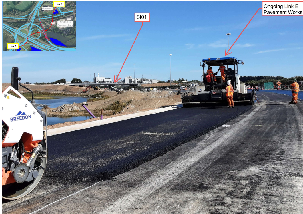
Pavement works being progressed offline in the Link A & E areas.