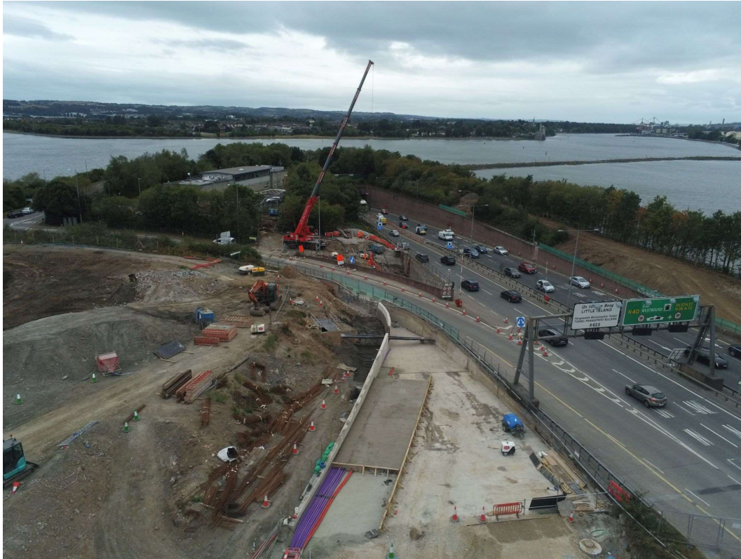
Works ongoing at Structure ST11 alongside the N40 southbound.