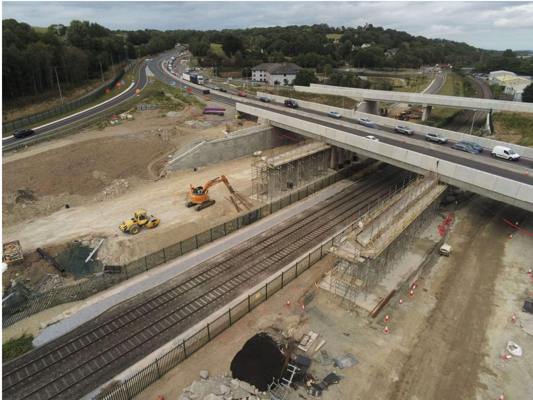
Works ongoing at ST08 alongside the M8 northbound.