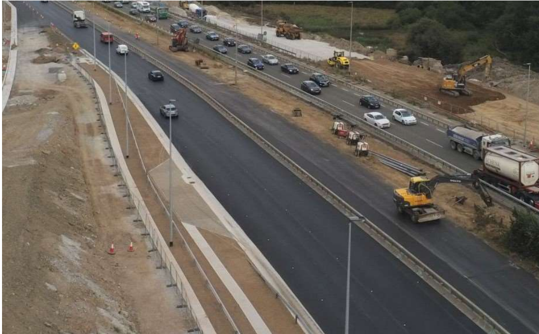
Site clearance works being completed within the existing N25 central median.