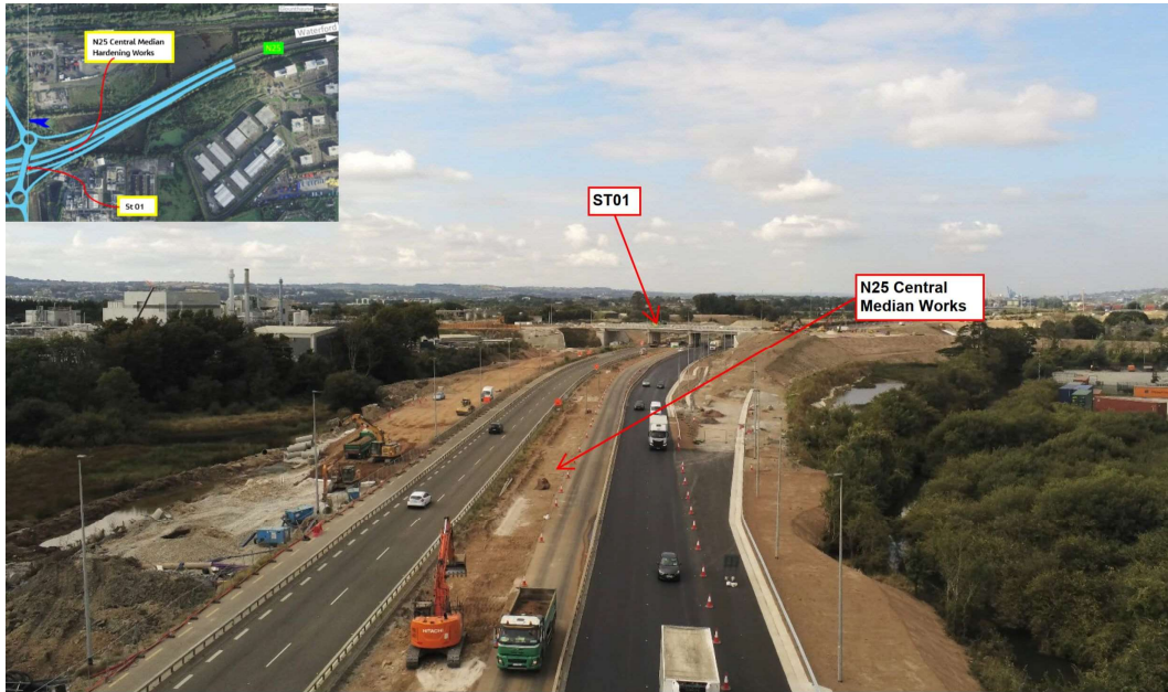
Works being progressed within the N25 central median.