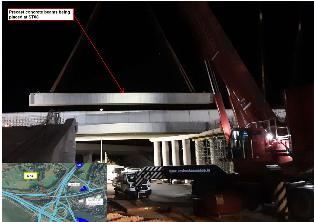
Pre-cast concrete bridge in being place at ST08 west.