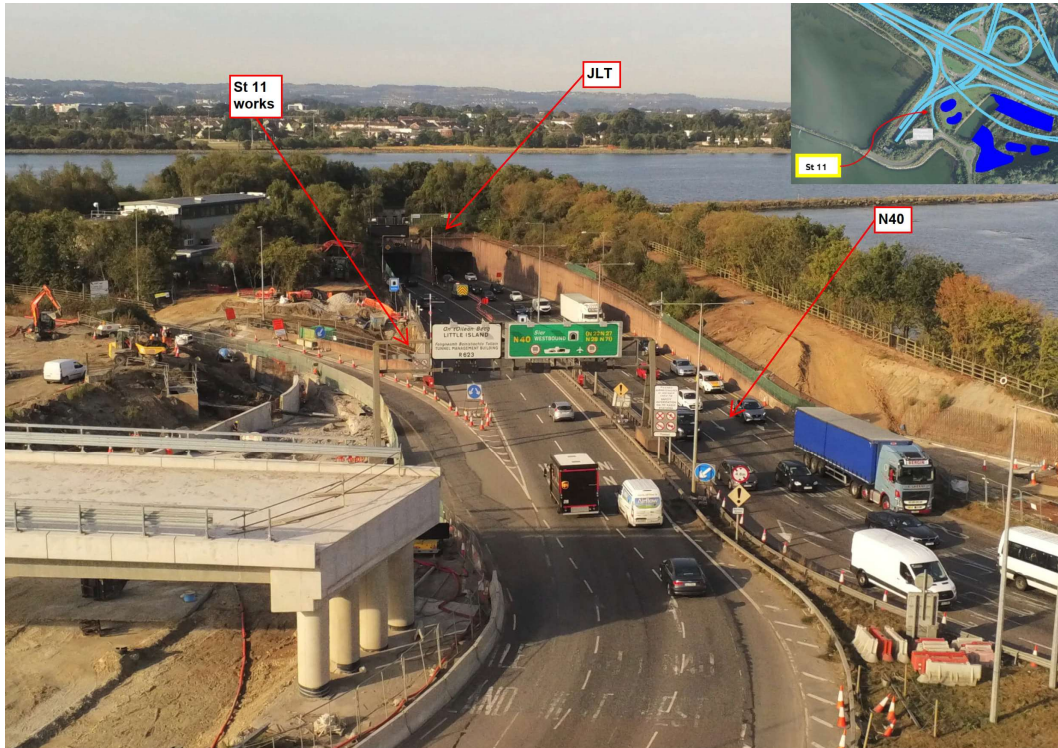
Works being progressed at the interface with the Jack Lynch Tunnel.

This week's progress update shows the ongoing works along Link E/A which will provide the new free flow link from the M8 southbound to the N25 eastbound.