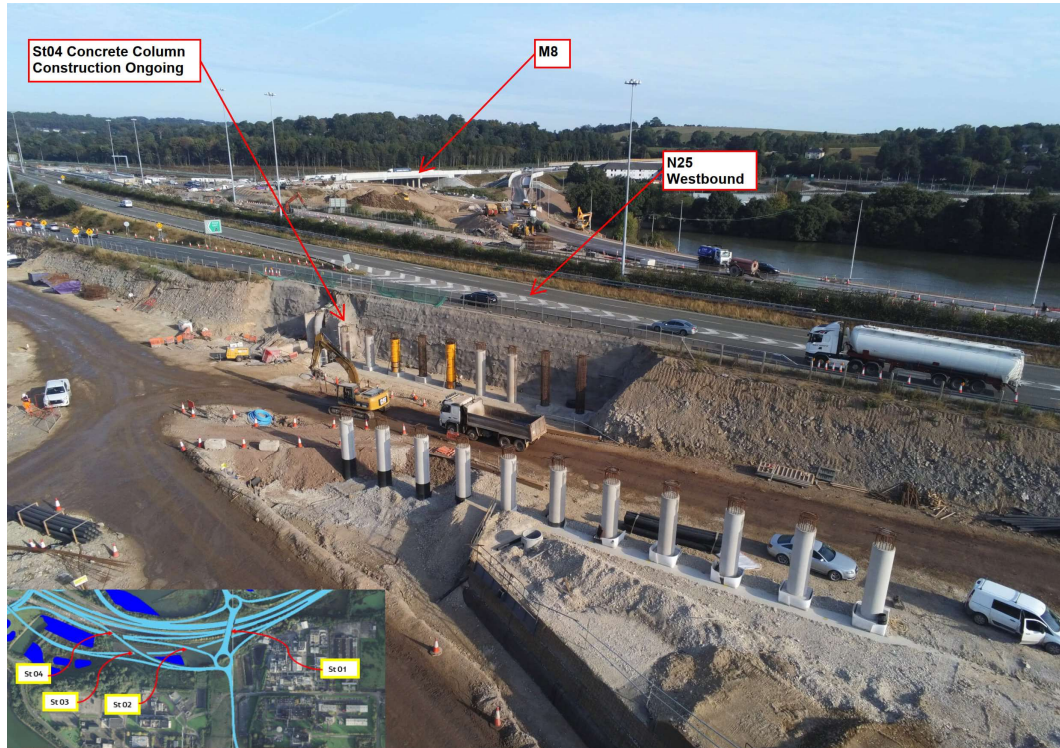
Construction of concrete columns ongoing at ST04 alongside the N25 westbound.