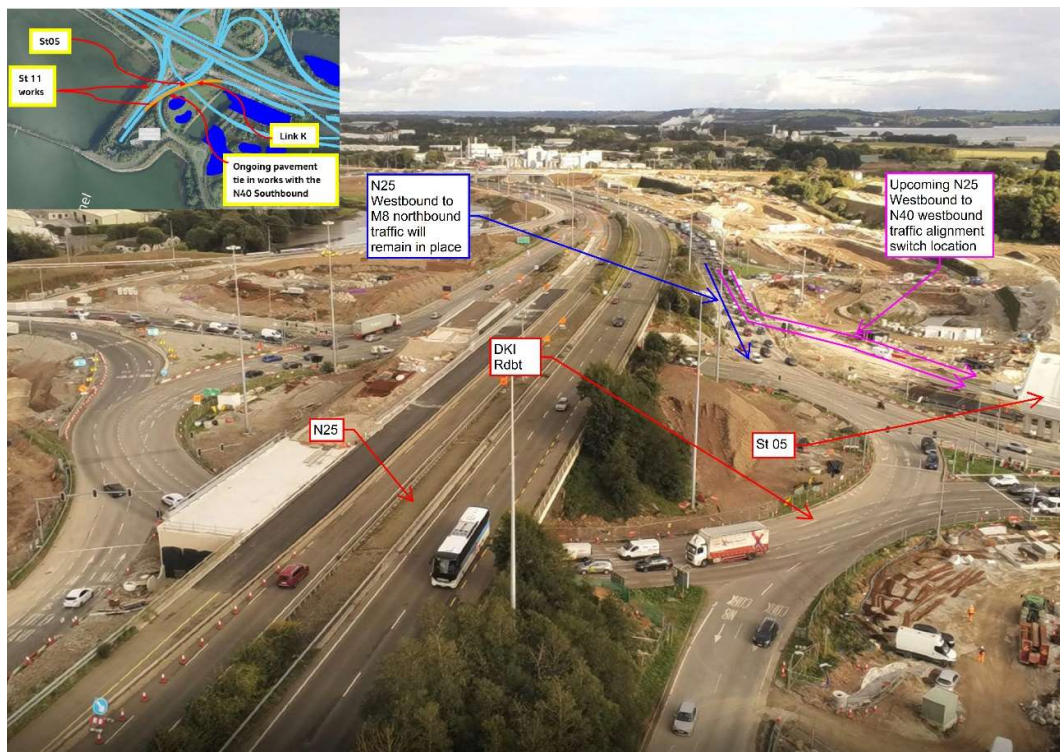
Upcoming traffic realignment on the N25 westbound diverge approach to the DKI Roundabout.