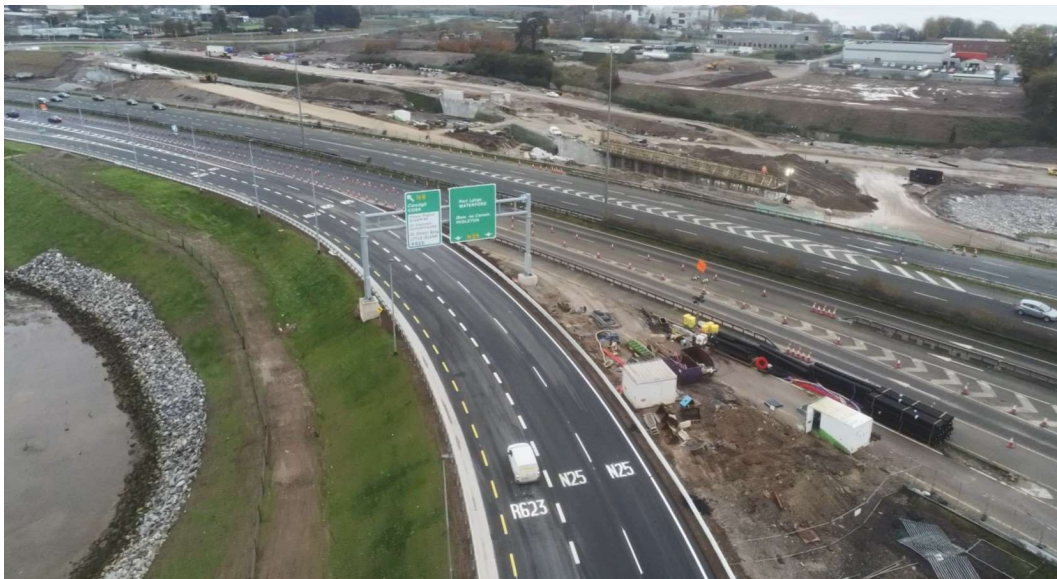
Link A/E Merge with N25 Eastbound.