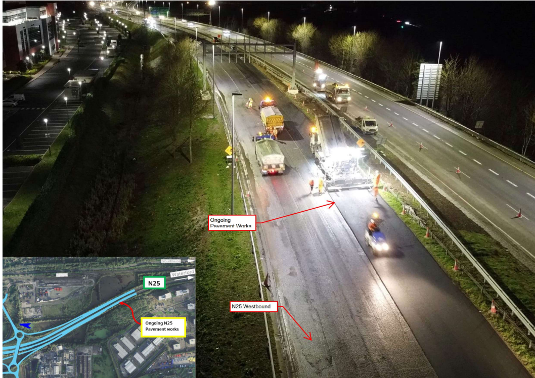
Pavement works being undertaken at night on the N25 westbound.