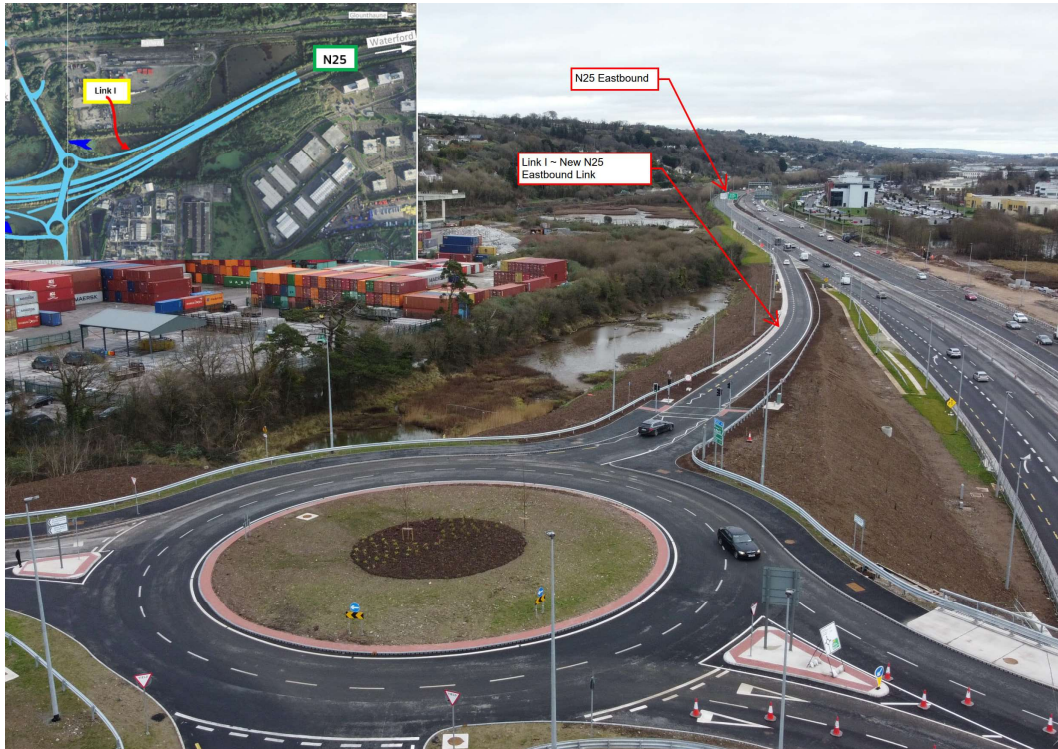
Link I – new access to the N25 eastbound.