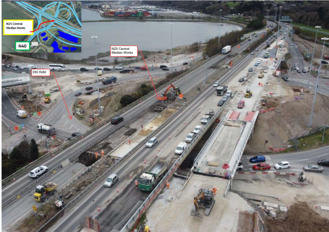
Preparatory works being progressed in advance of upcoming pavement works in the N25 central median.