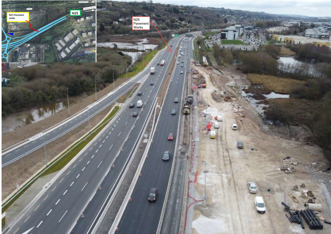
Surfacing works completed east of Structure St01.