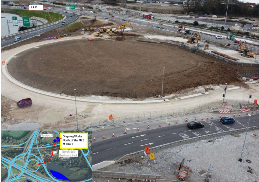
Works being progressed on Link F alongside the N25 eastbound.