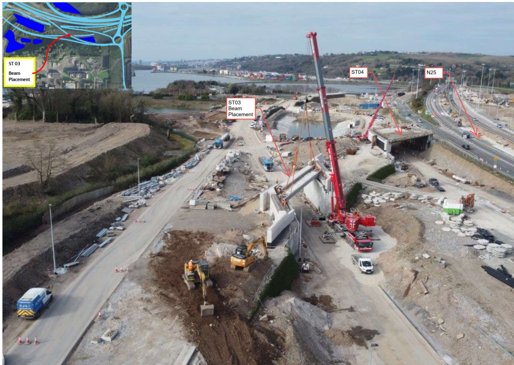
Final set of Bridge Beams being placed at Structure St03.