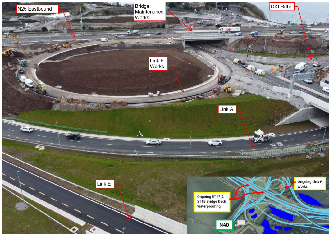
Works ongoing at Link F alongside the N25 eastbound.