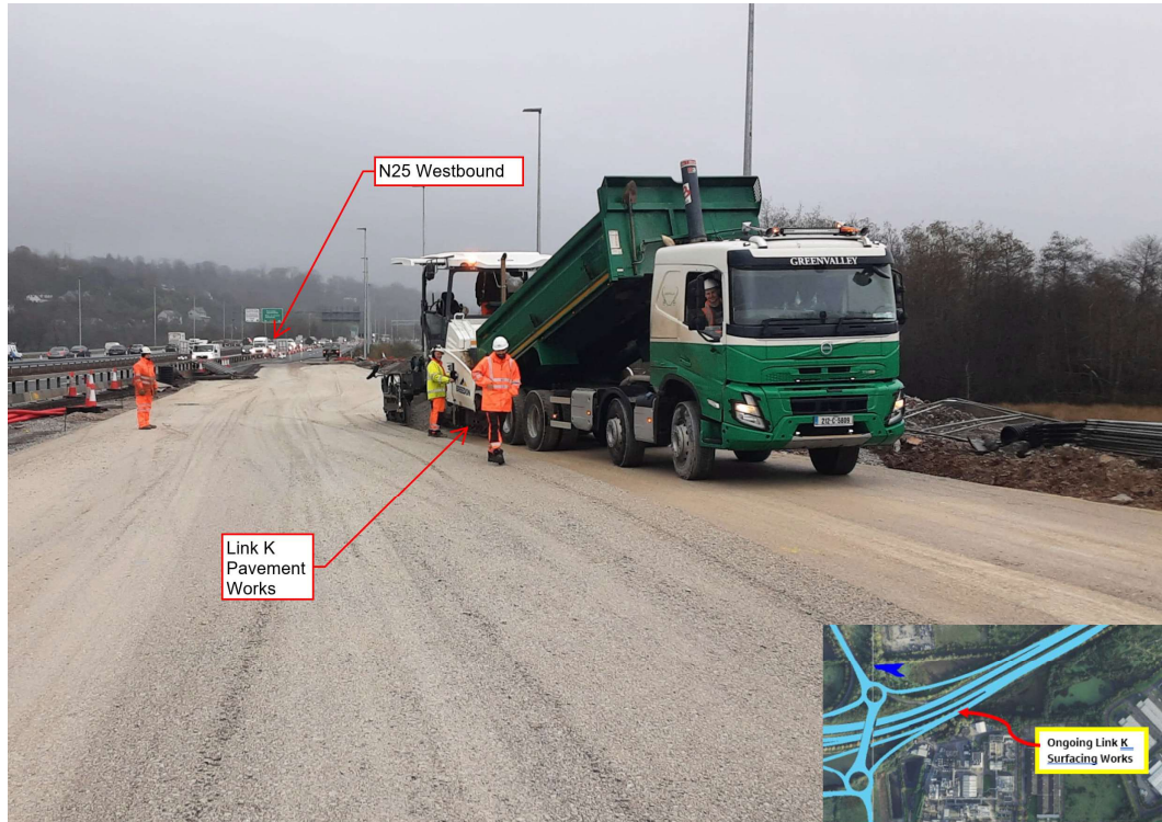
Pavement works ongoing for Link K alongside the N25 westbound.