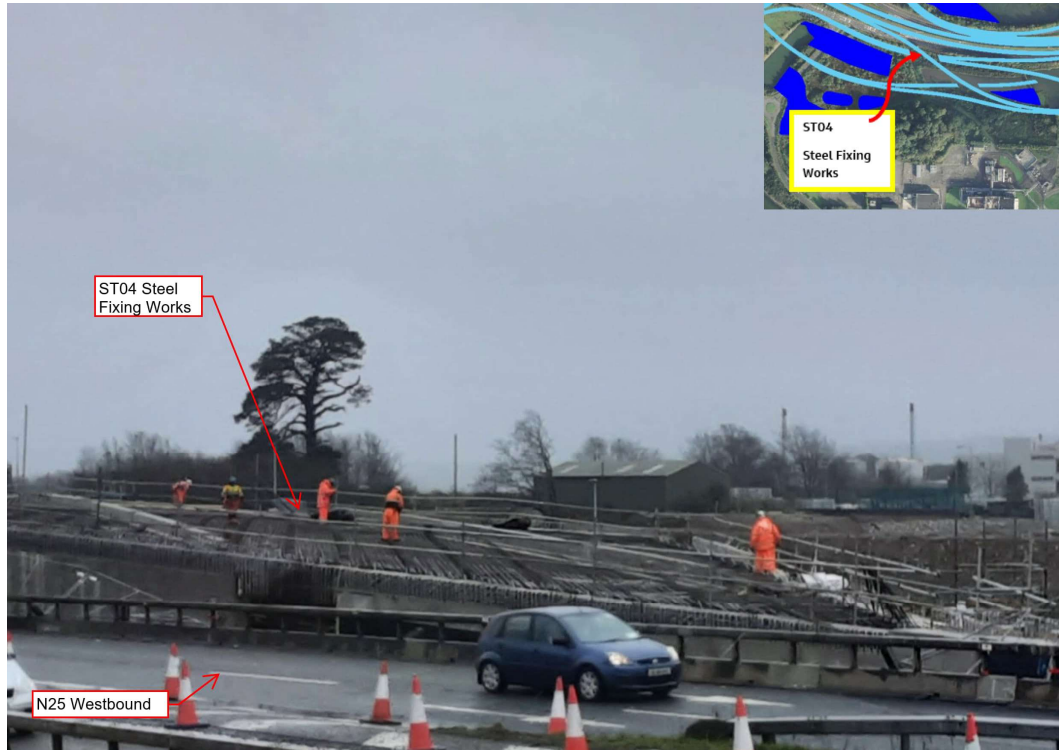
Steel fixing ongoing alongside the N25 westbound diverge to the Interchange Roundabout.