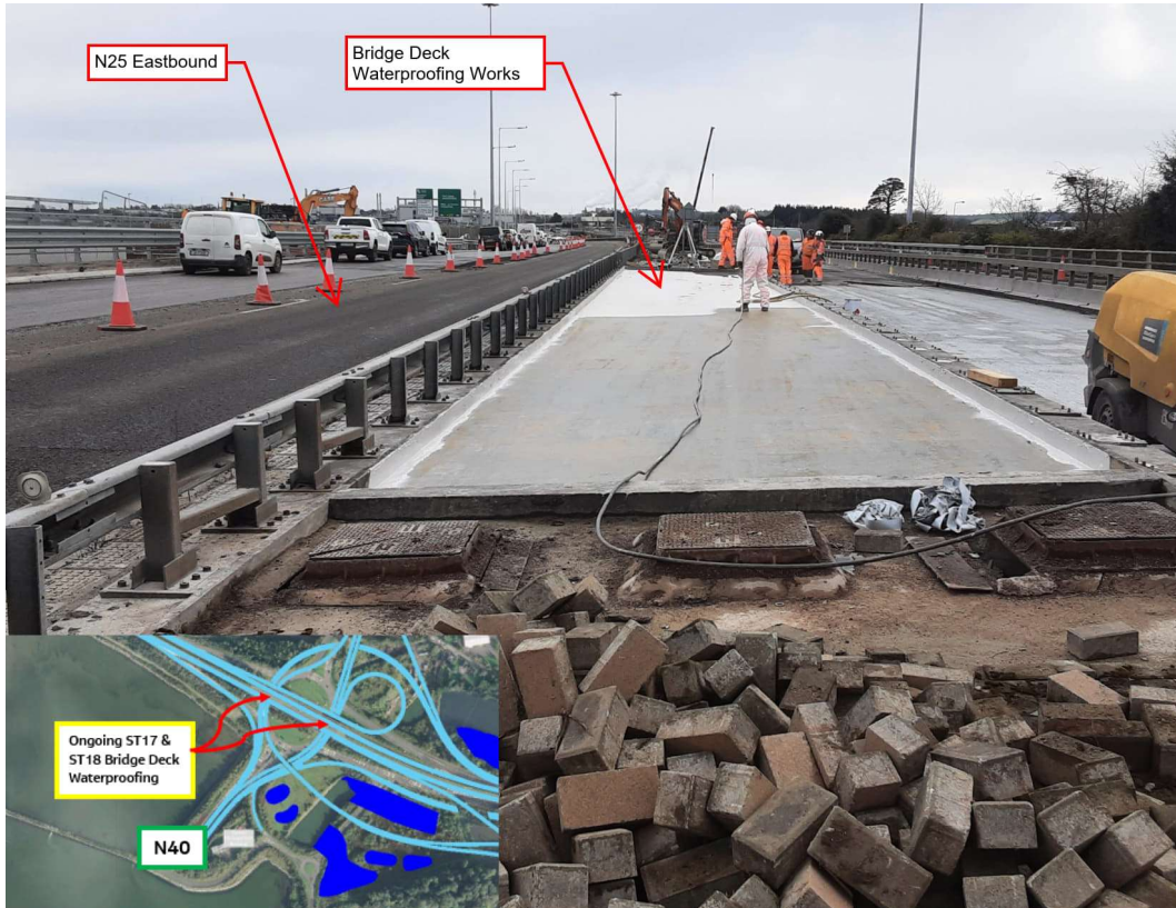
Bridge deck waterproofing works ongoing at the location of the existing Interchange Structures on the N25.