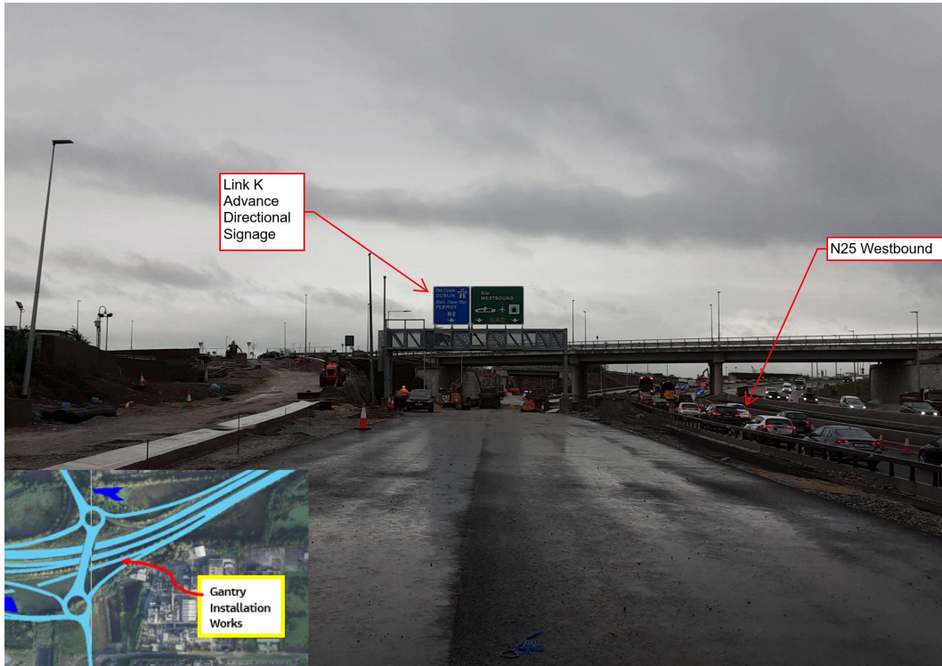
Advance directional signage installed on site during the period for Link K.