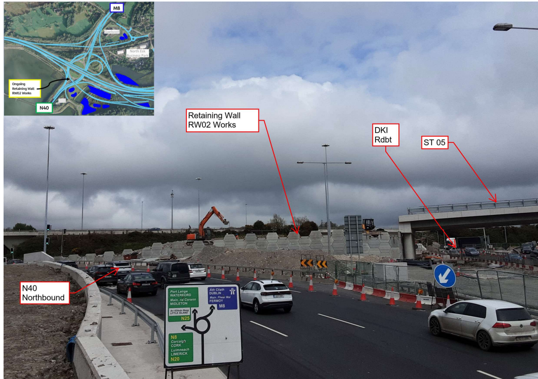
Retaining Wall RW02 construction ongoing alongside the N40 at the Interchange Roundabout