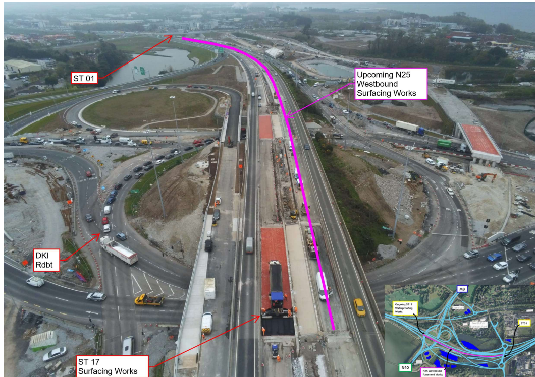
Installation of the sand carpet surface on top of the renewed waterproofing on Structure ST17