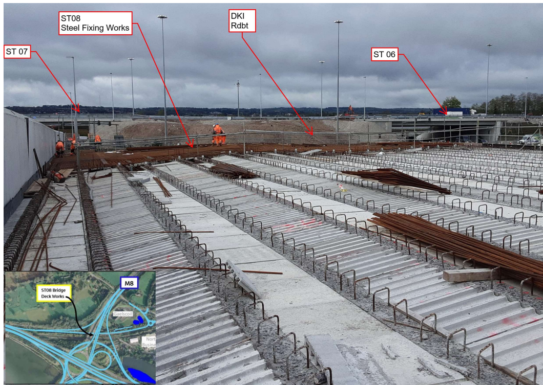
Steel fixing works ongoing at Structure ST08