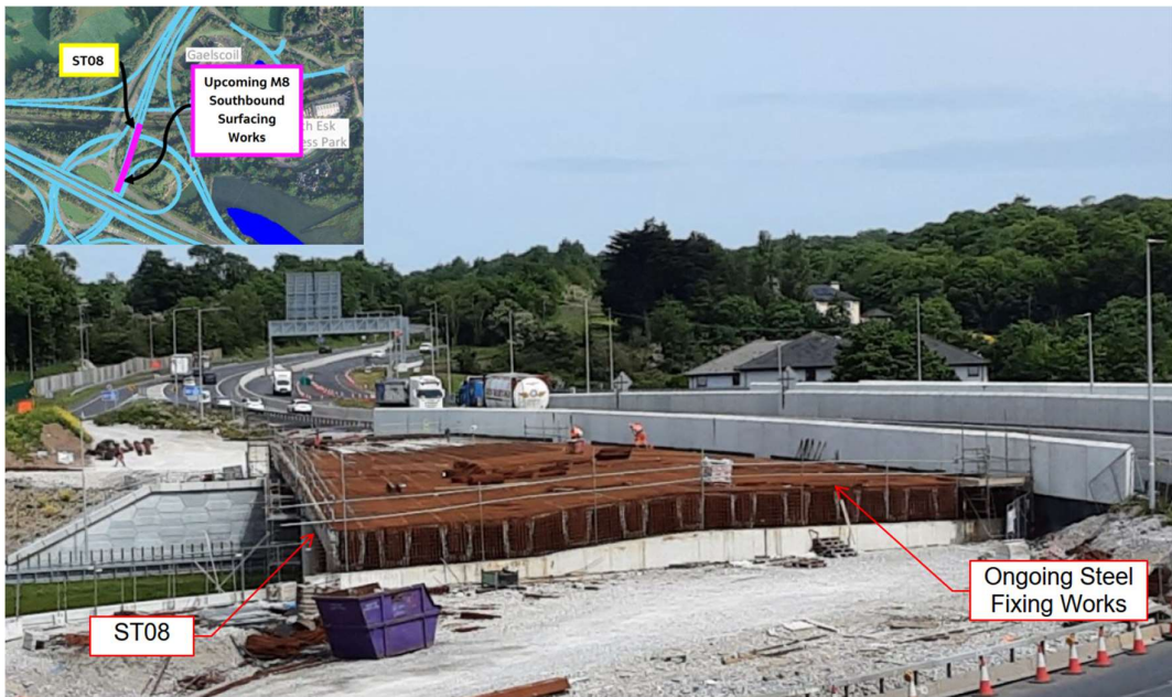
Steel fixing works ongoing at Structure ST08.