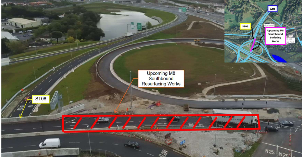
Recent aerial shot showing the section of the M8 southbound to be surfaced over the coming period