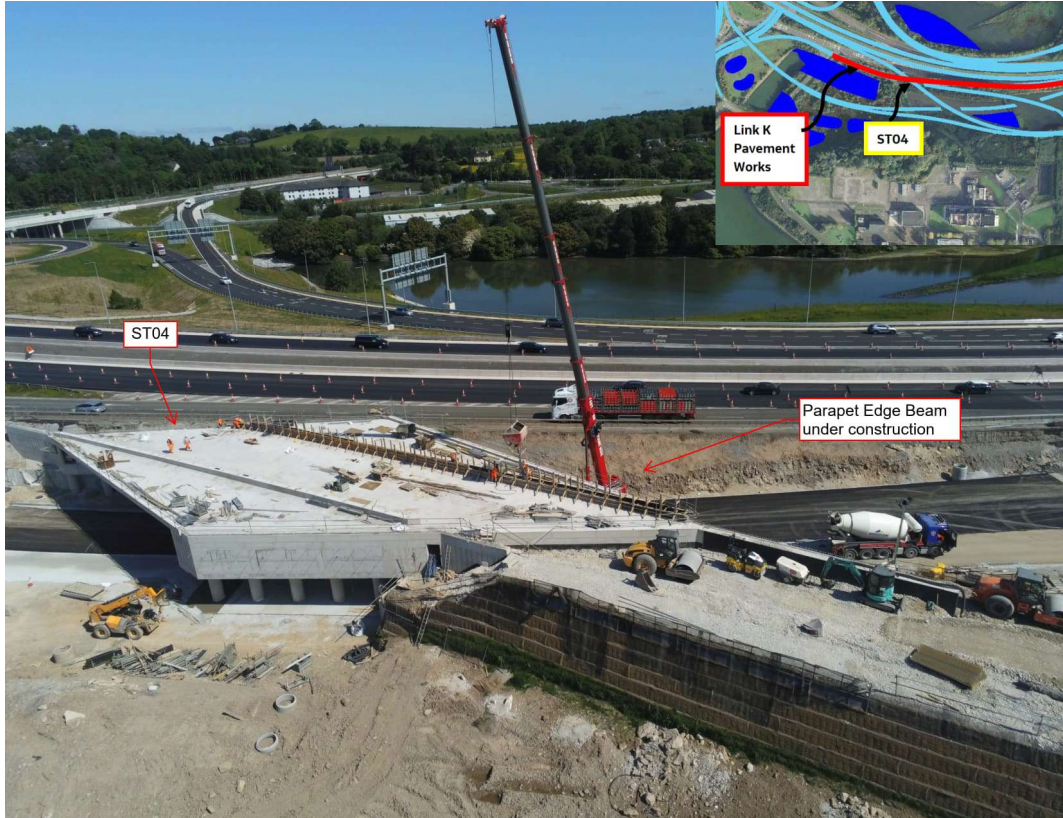
Parapet edge beam under construction at Structure ST04.