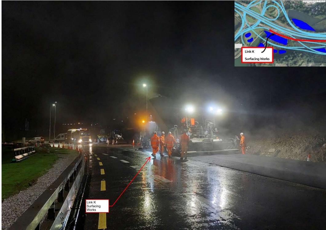
Surfacing works ongoing on Link K under night-time working