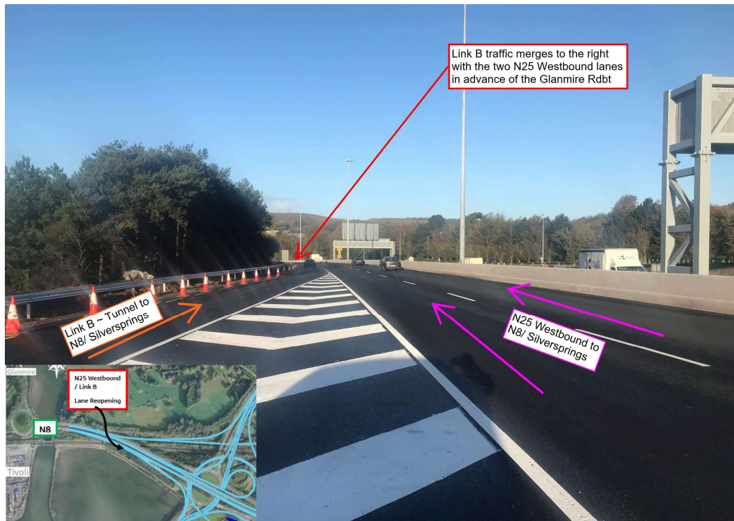
Current lane configuration at Link B / N25 Westbound merge