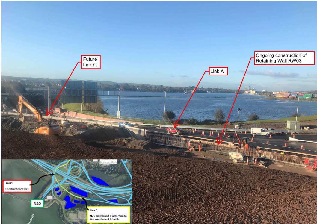
RW03 currently under construction