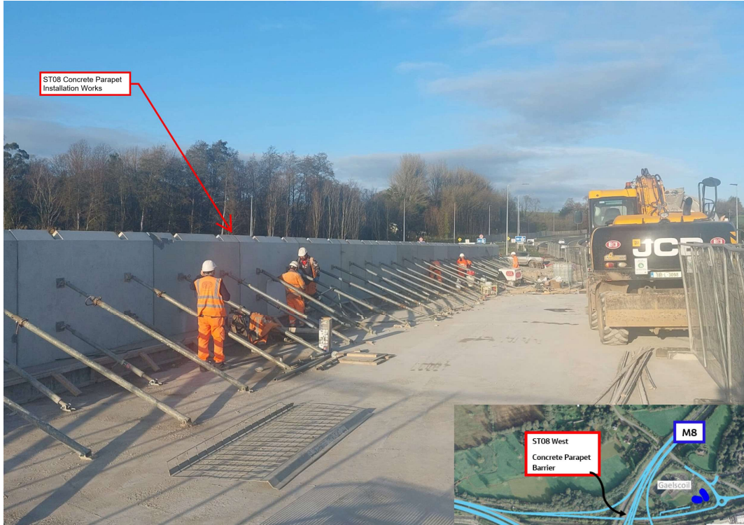
Installation of concrete parapets at Structure ST08 West