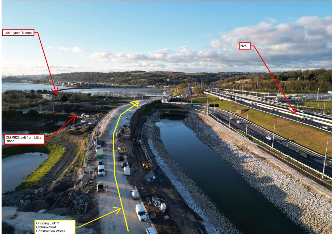
Earthworks ongoing at the old R623 crossing point to the N25 Westbound