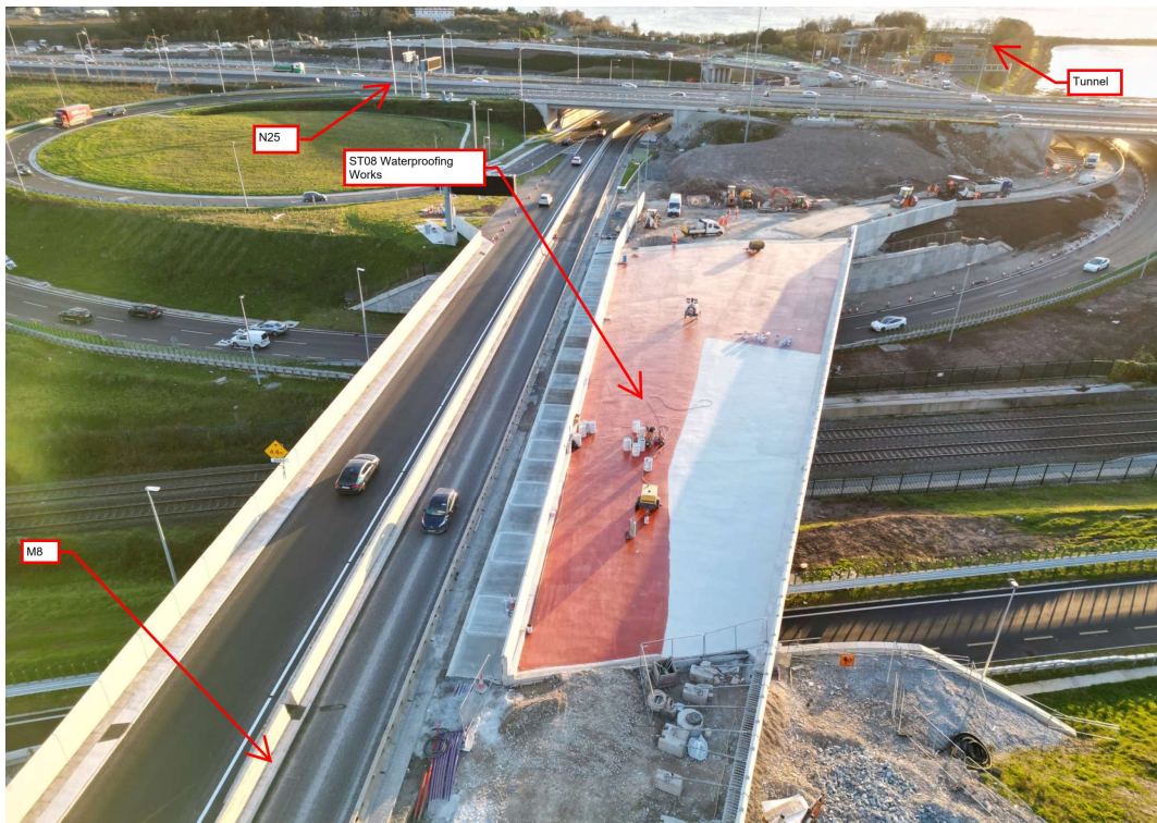
Waterproofing works at Structure ST08