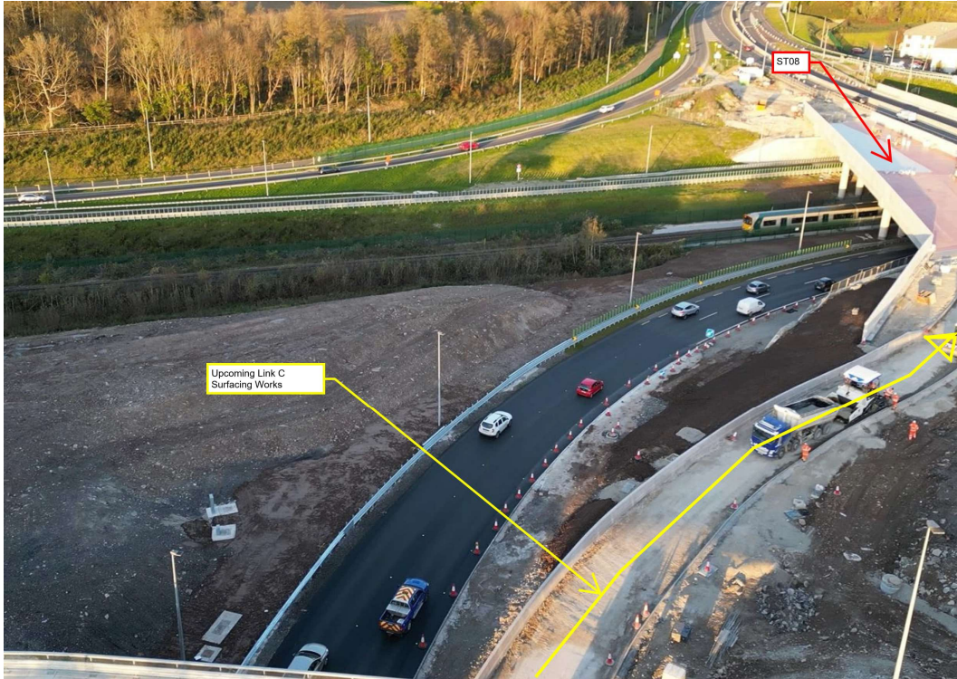
Upcoming roadworks on Link C