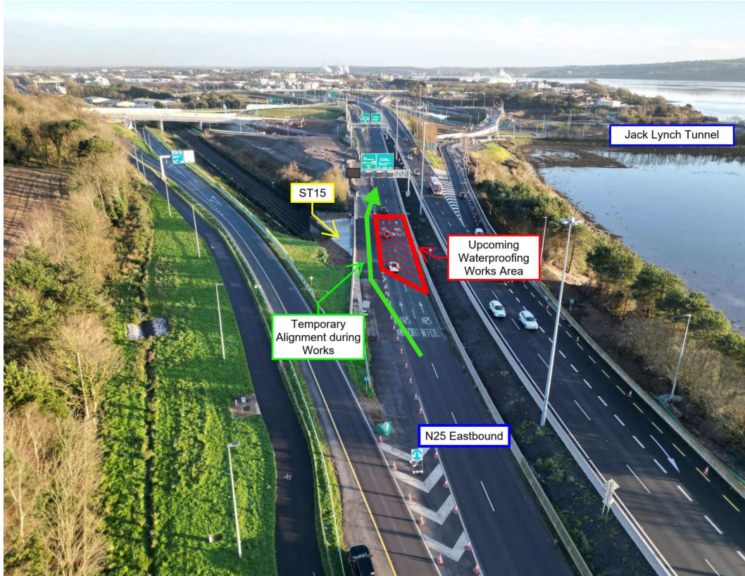
Area highlighted shows the extent of bridge deck waterproofing required