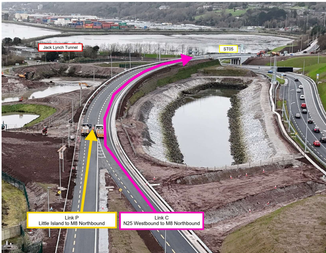
Link C and Link P South of the N25